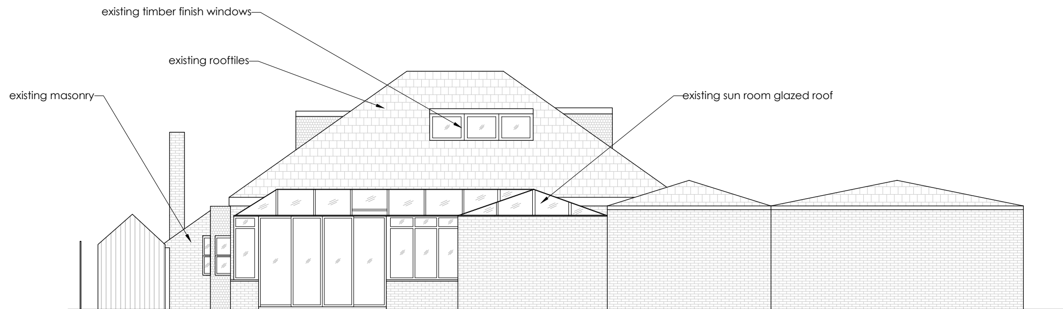
ELEVATION A-A (SOUTH) - EXISTING