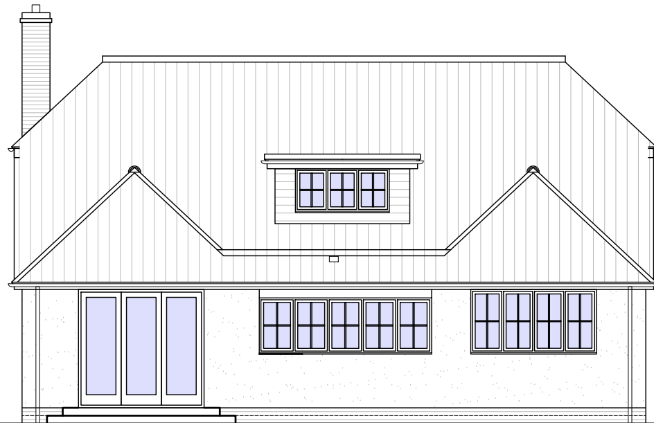
Rear Elevation (North) As Proposed