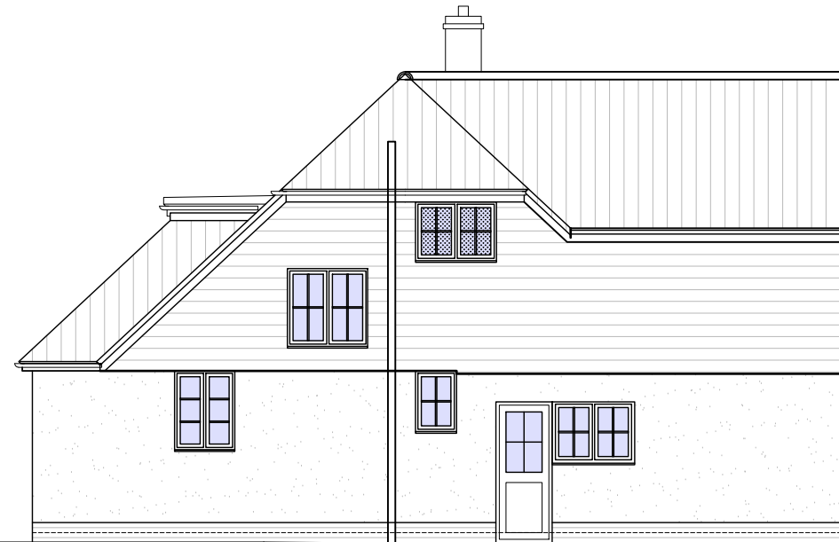
Side Elevation (West) As Proposed