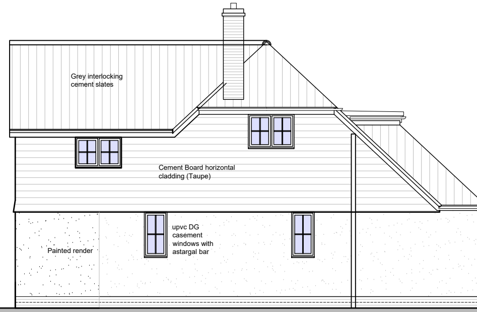
Side Elevation (East) As Proposed