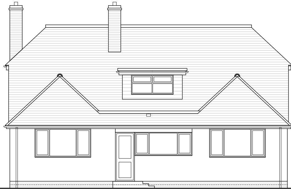
Rear Elevation (North) As Existing