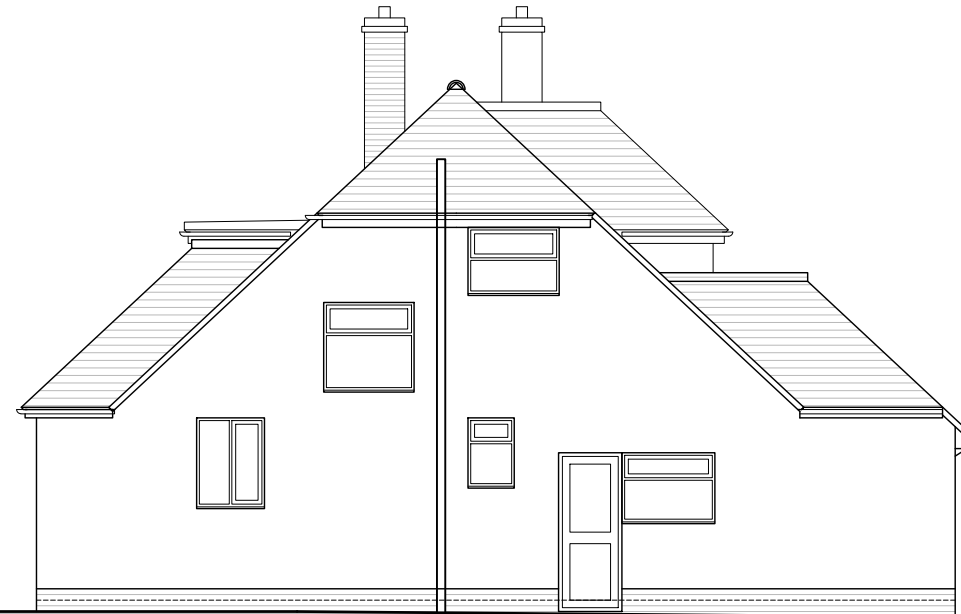
Side Elevation (West) As Existing