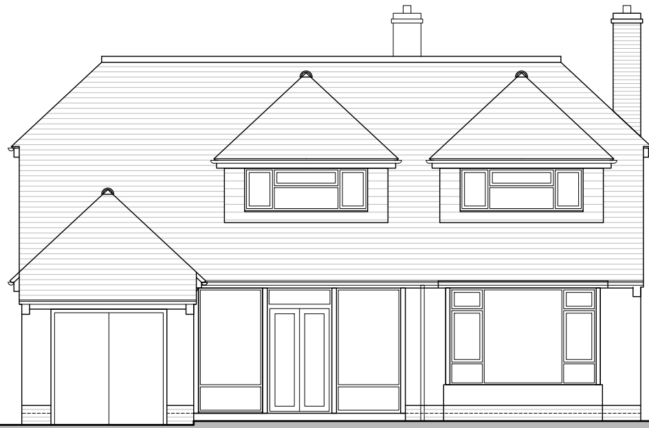
Front Elevation (South) As Existing

It is the responsibility of the Client to check Legal Boundaries are correctly indicated and that relevant Party Wall Notices (usually served via a Surveyor) where required have been served to adjoining neighbours prior to any commencement of works. No responsibility will be held by Simon Harvey Designs Ltd for any failure in the above.