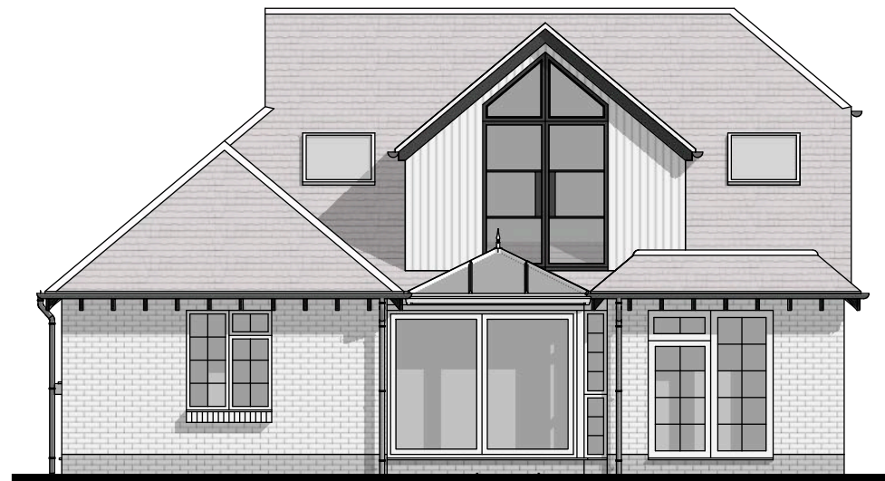
South Elev Scale 1:100 @ A3