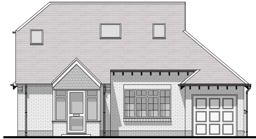
North Elev Scale 1:100 @ A3