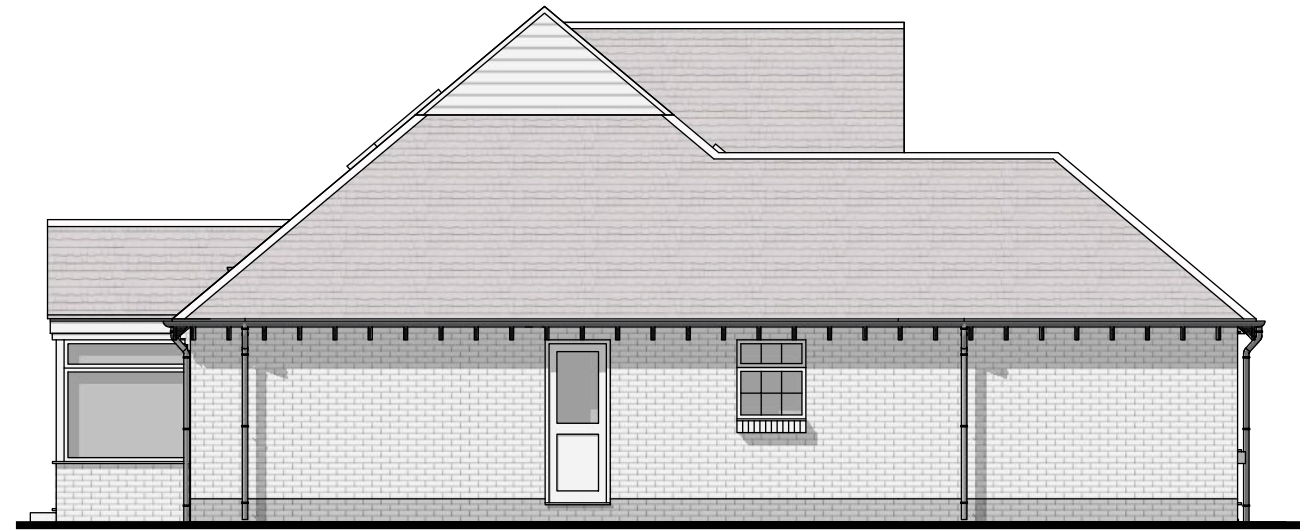
West Elev Scale 1:100 @ A3