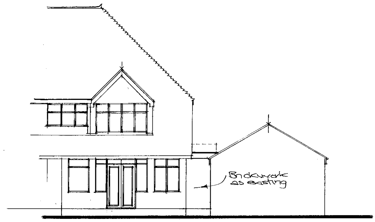
Proposed South Elevation - scale: 1/100