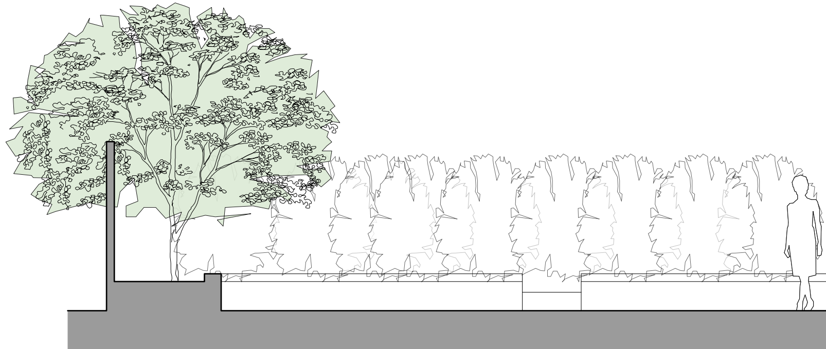
Existing Sectional Elevation A