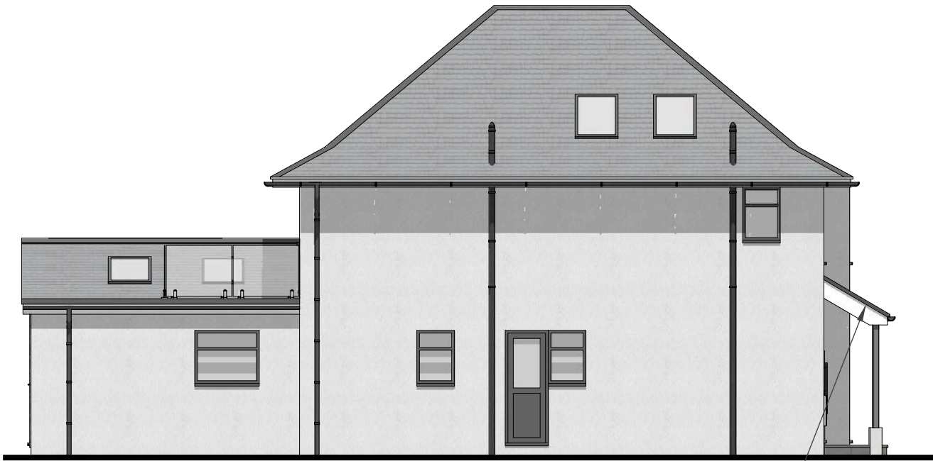
West Elev Scale 1:100 @ A3