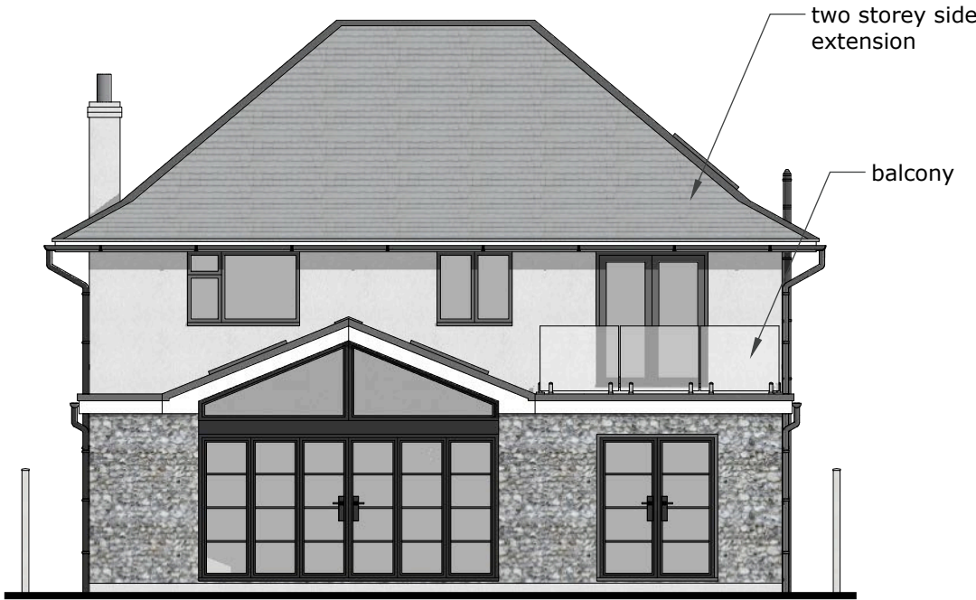
North Elev Scale 1:100 @ A3