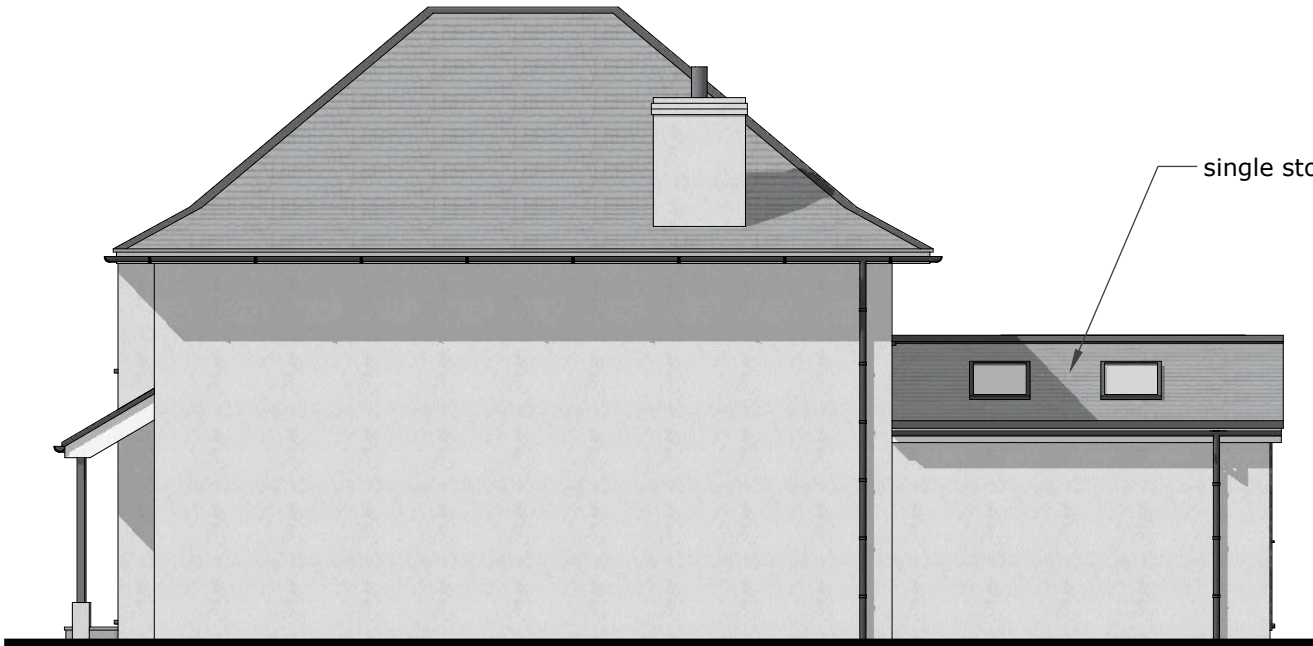
East Elev Scale 1:100 @ A3