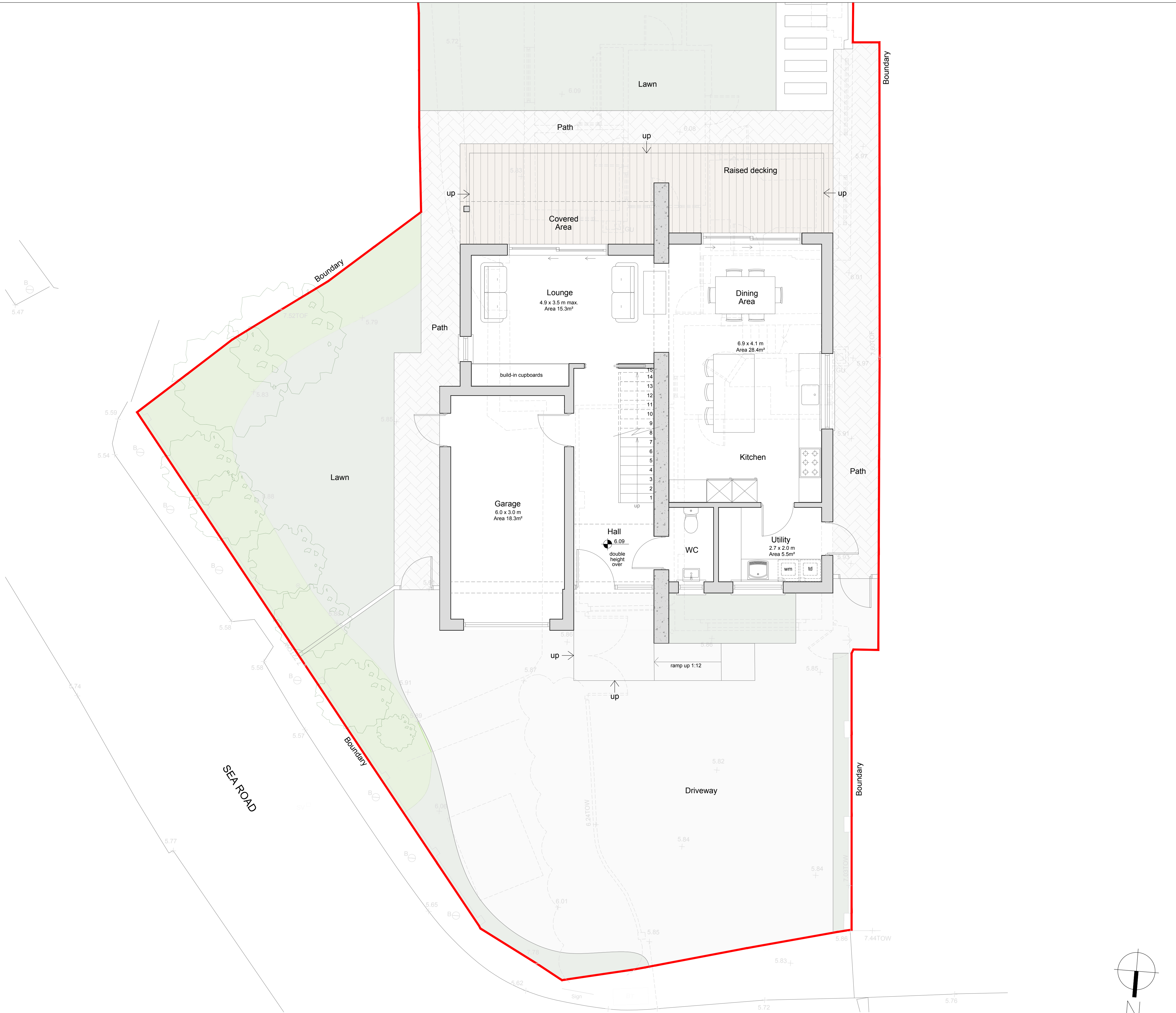
Ground Floor Plan 1: 50