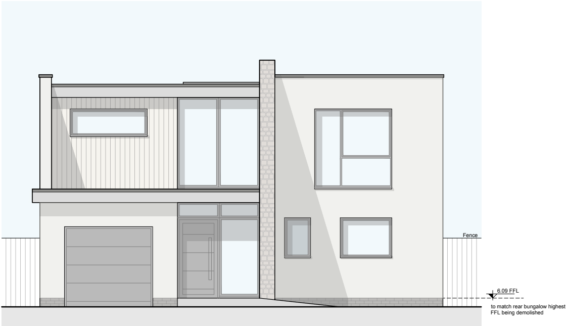
Front Elevation (North) 1:100