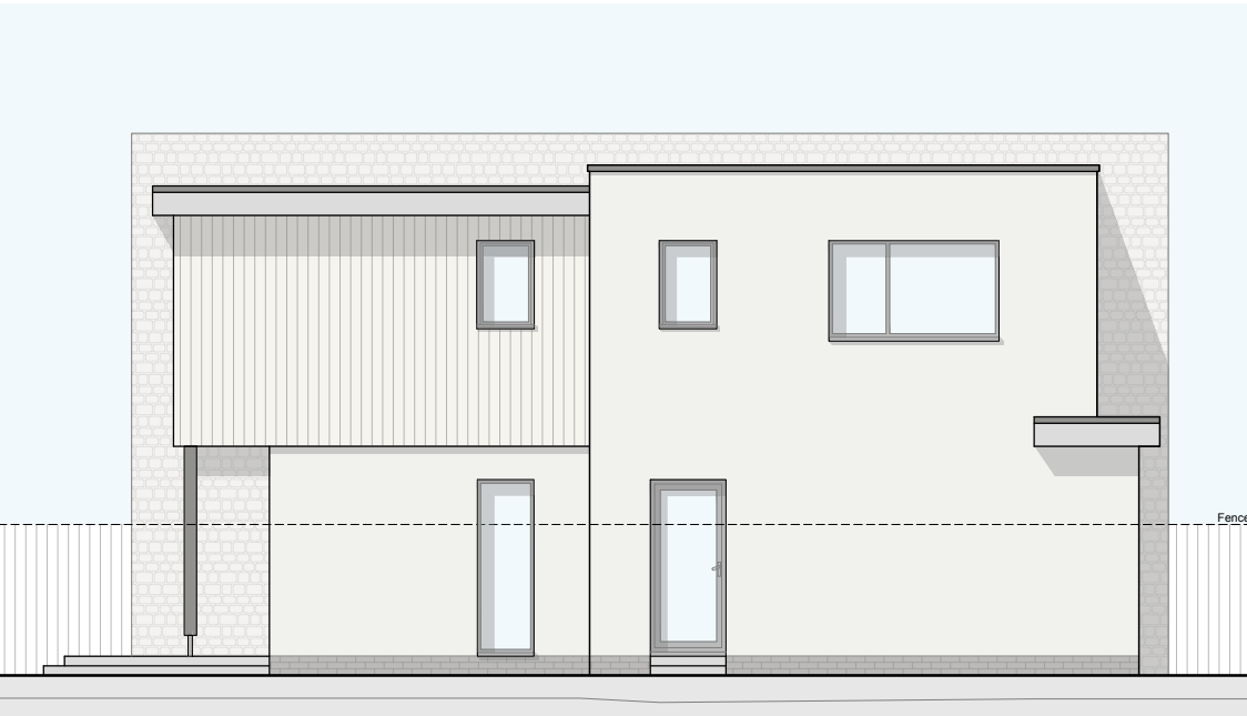
Side Elevation (East) 1:100