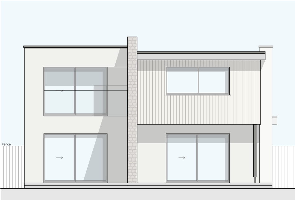
Rear Elevation (South) 1:100