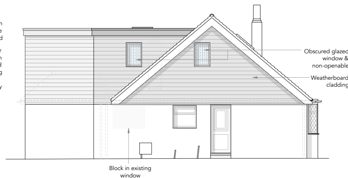
West Elevation (Side) 1:100