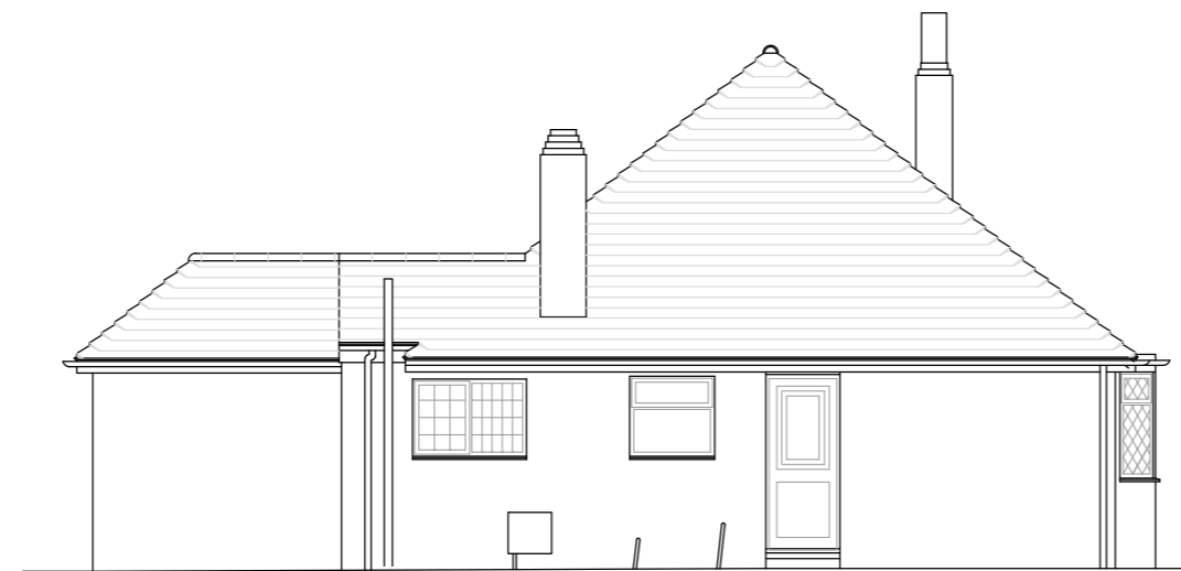
West Elevation (Side) 1:100