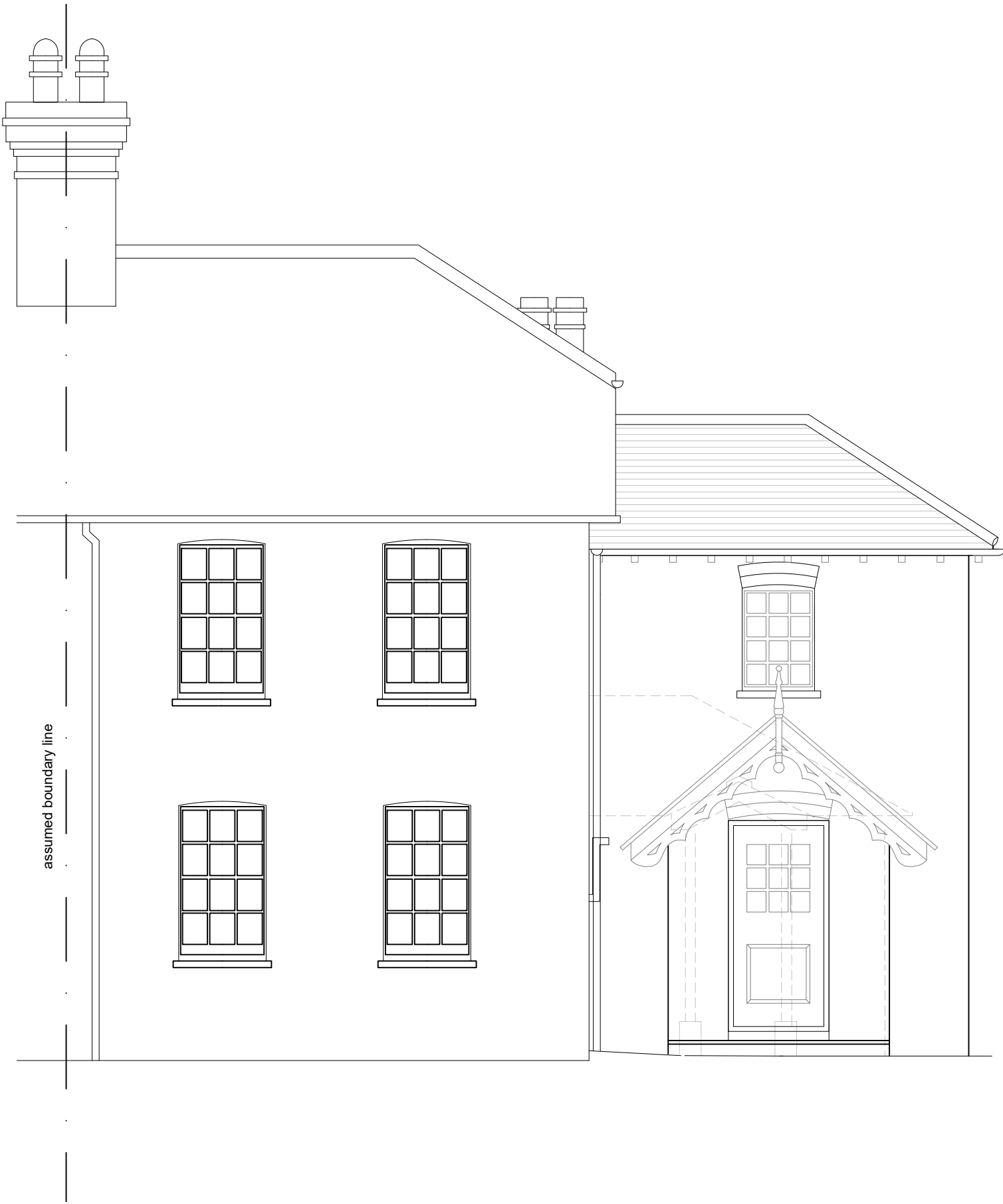
Proposed West Elevation 1:50