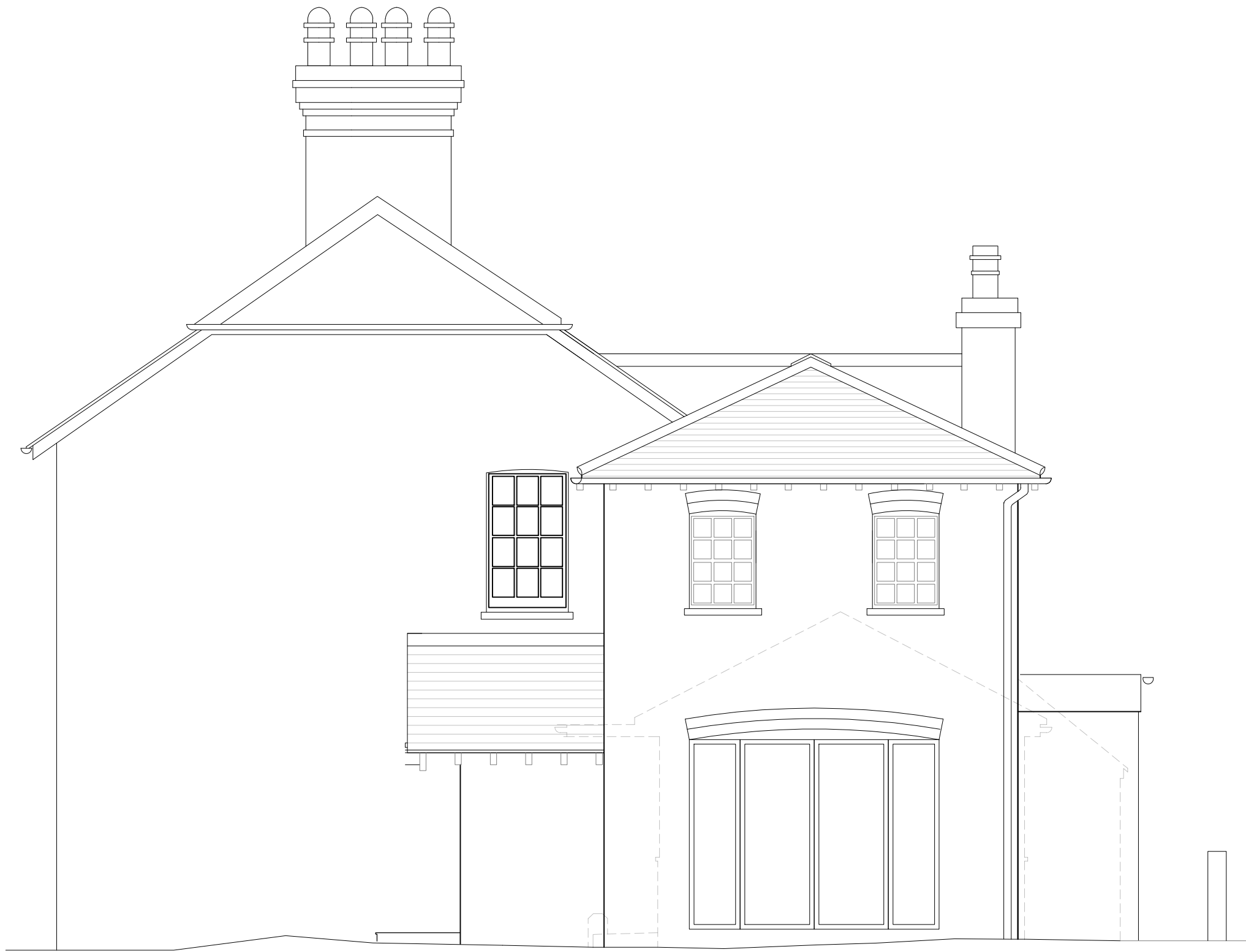
Proposed South Elevation 1:50