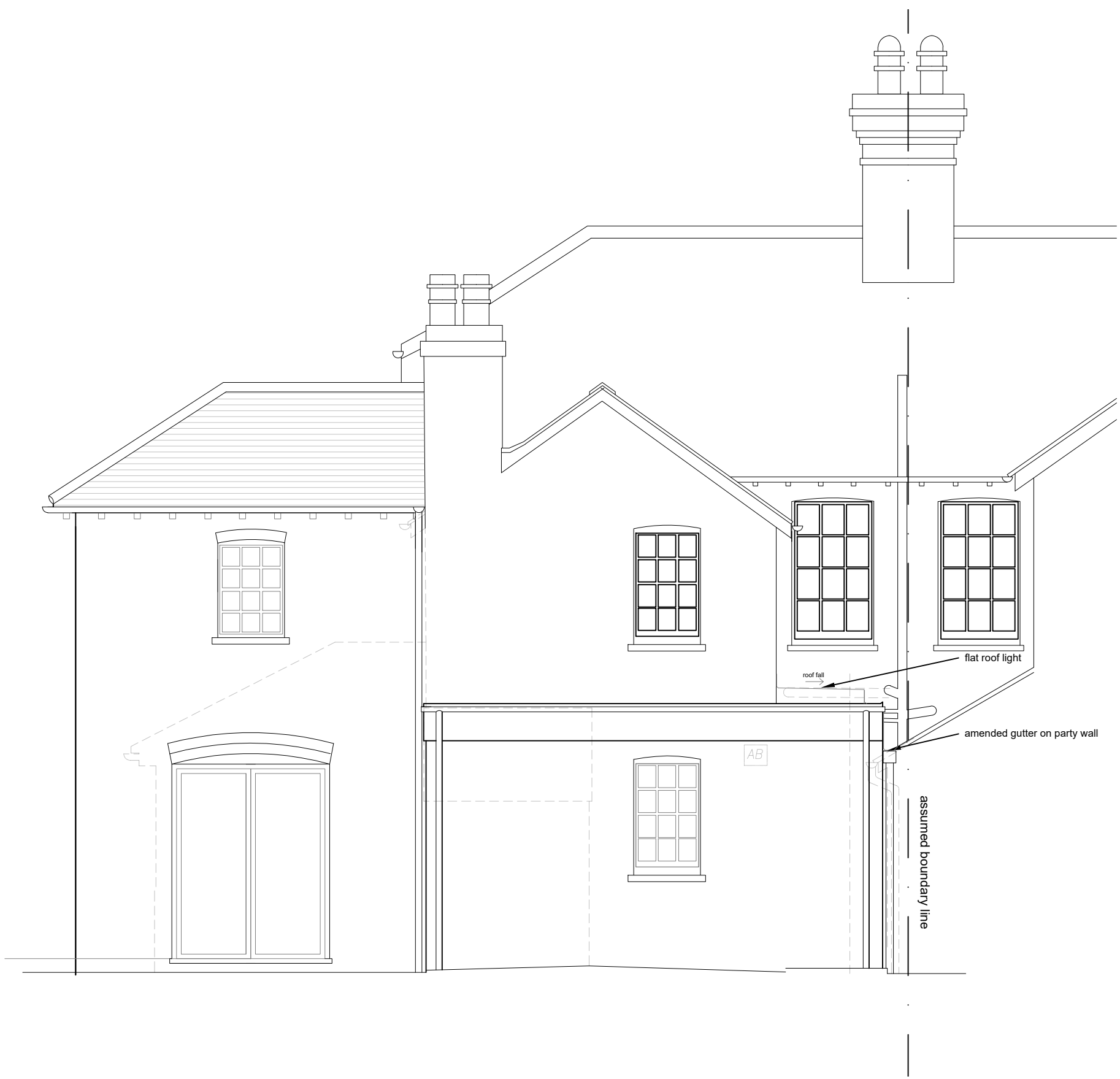
Proposed East Elevation 1:50