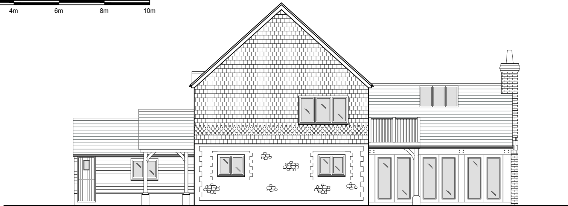
PROPOSED SOUTH ELEVATION 1:100 @ A3

© jbarchitecture, all rights reserved. Use figured dimensions only. All dimensions are to be checked on site before any work is carried out. Please contact the Architect immediately regarding any discrepancies discovered on site.