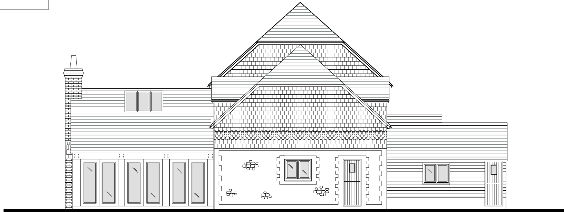
PROPOSED NORTH ELEVATION 1:100 @ A3