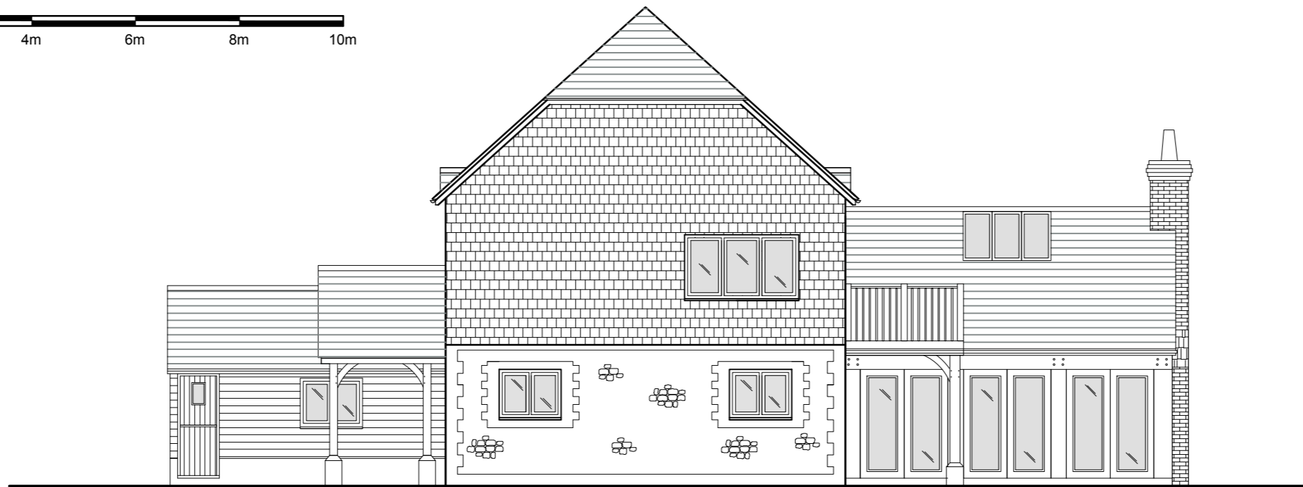
PROPOSED SOUTH ELEVATION 1:100 @ A3

© jbachitecture, all rights reserved. Use figured dimensions only. All dimensions are to be checked on site before any work is carried out. Please contact the Architect immediately regarding any discrepancies discovered on site.