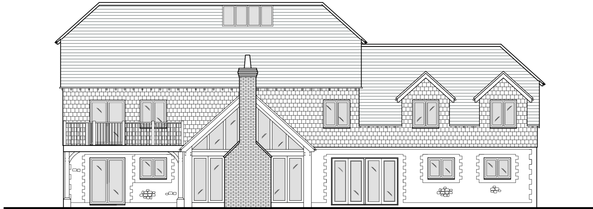
PROPOSED EAST ELEVATION 1:100 @ A3

© jbarchitecture, all rights reserved. Use figured dimensions only. All dimensions are to be checked on site before any work is carried out. Please contact the Architect immediately regarding any discrepancies discovered on site.