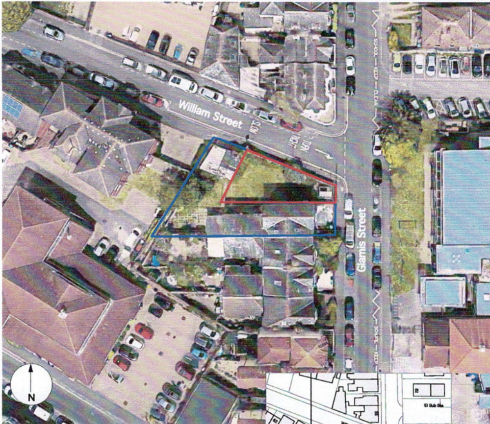
AERIAL PHOTO: SITE LOCATION on corner of Glamis Street and William Street