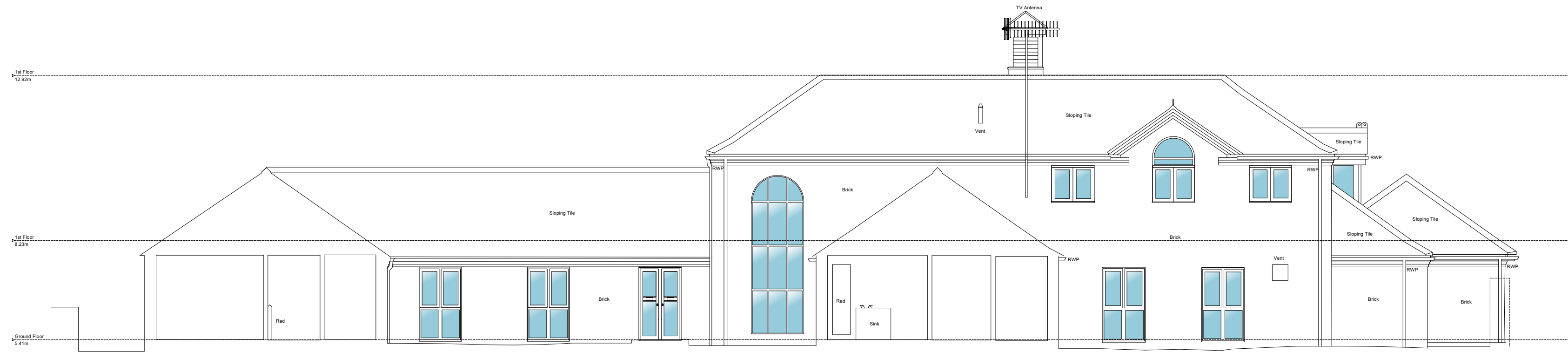
Courtyard section elevation south