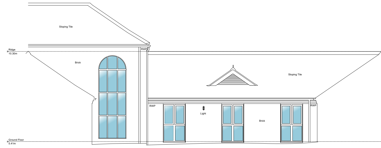
Courtyard section elevation west

23 Vine Street, Brighton BN1 4AG e: studio@sticklandwright.co.uk t: 01273 964051 Company registered in England No. 11222477