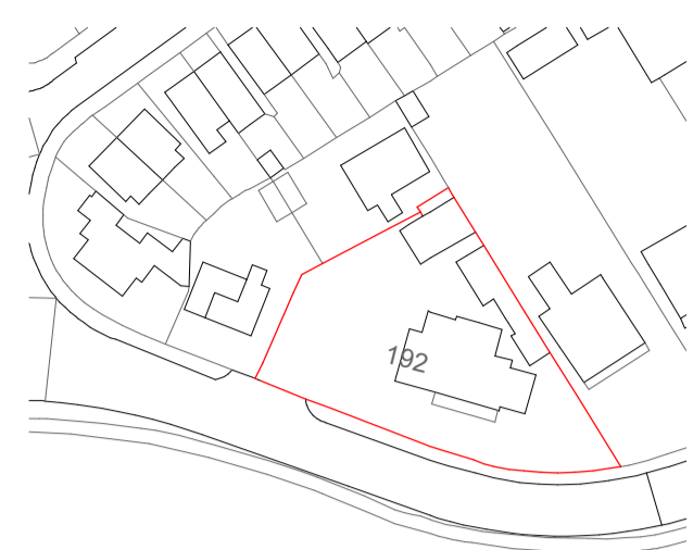
Site plan 1:1250