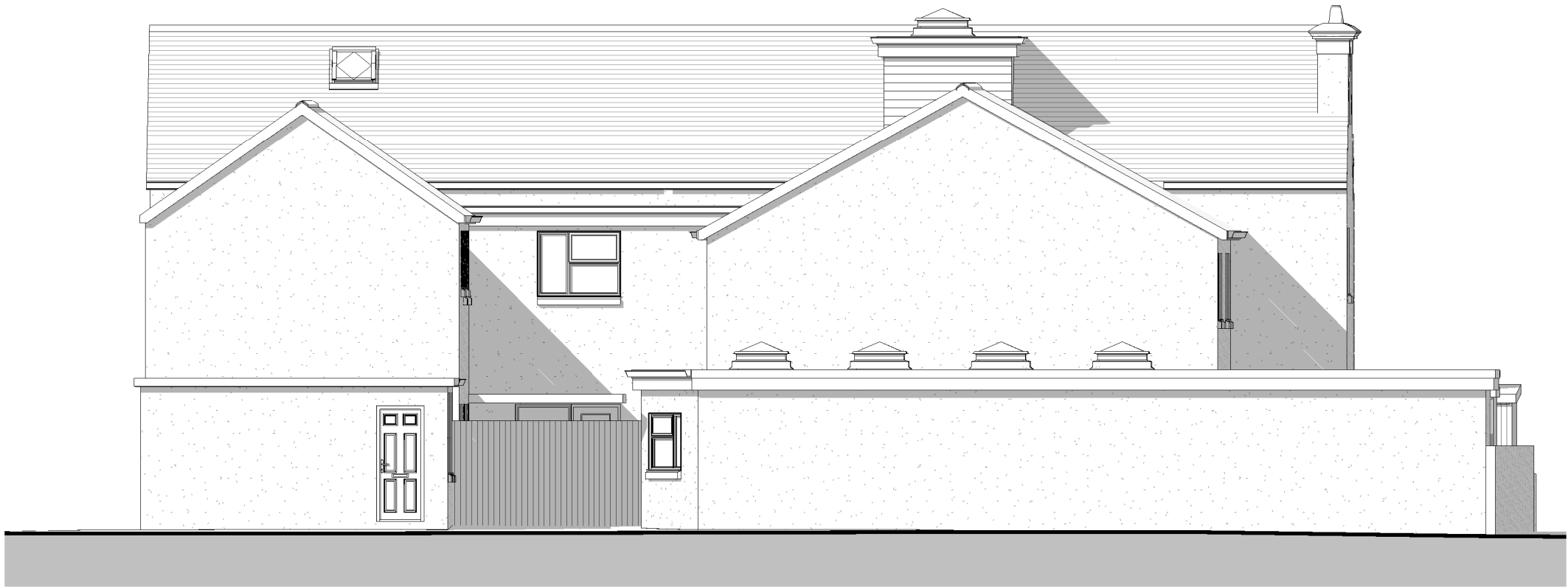
2. North East Elevation - Existing scale 1 : 100