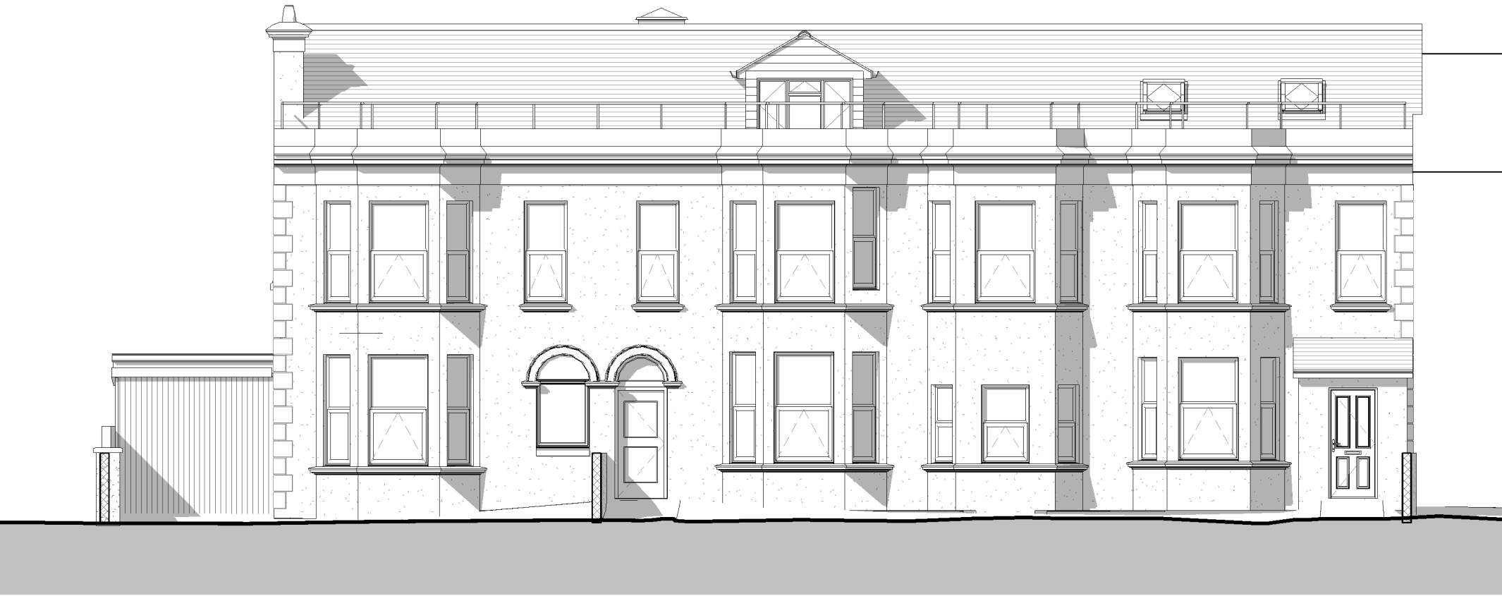
1. South West Elevation - Existing scale 1 : 100