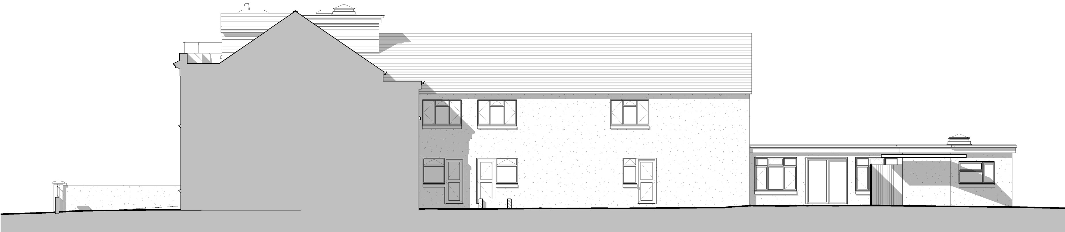
4. SE Elevation Courtyard - Existing scale 1 : 100