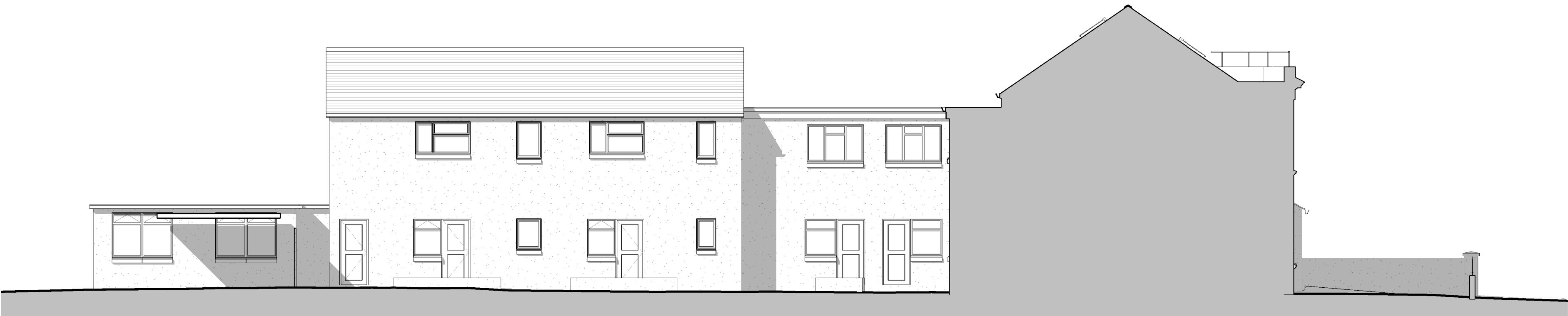
5. NE Elevation Courtyard - Existing scale 1 : 100

Permission is granted to scale from this drawing for the purposes of Local Authority Planning Approval only. Please verify that the information is correctly printed to scale by checking the 1:1 scale control bar below.