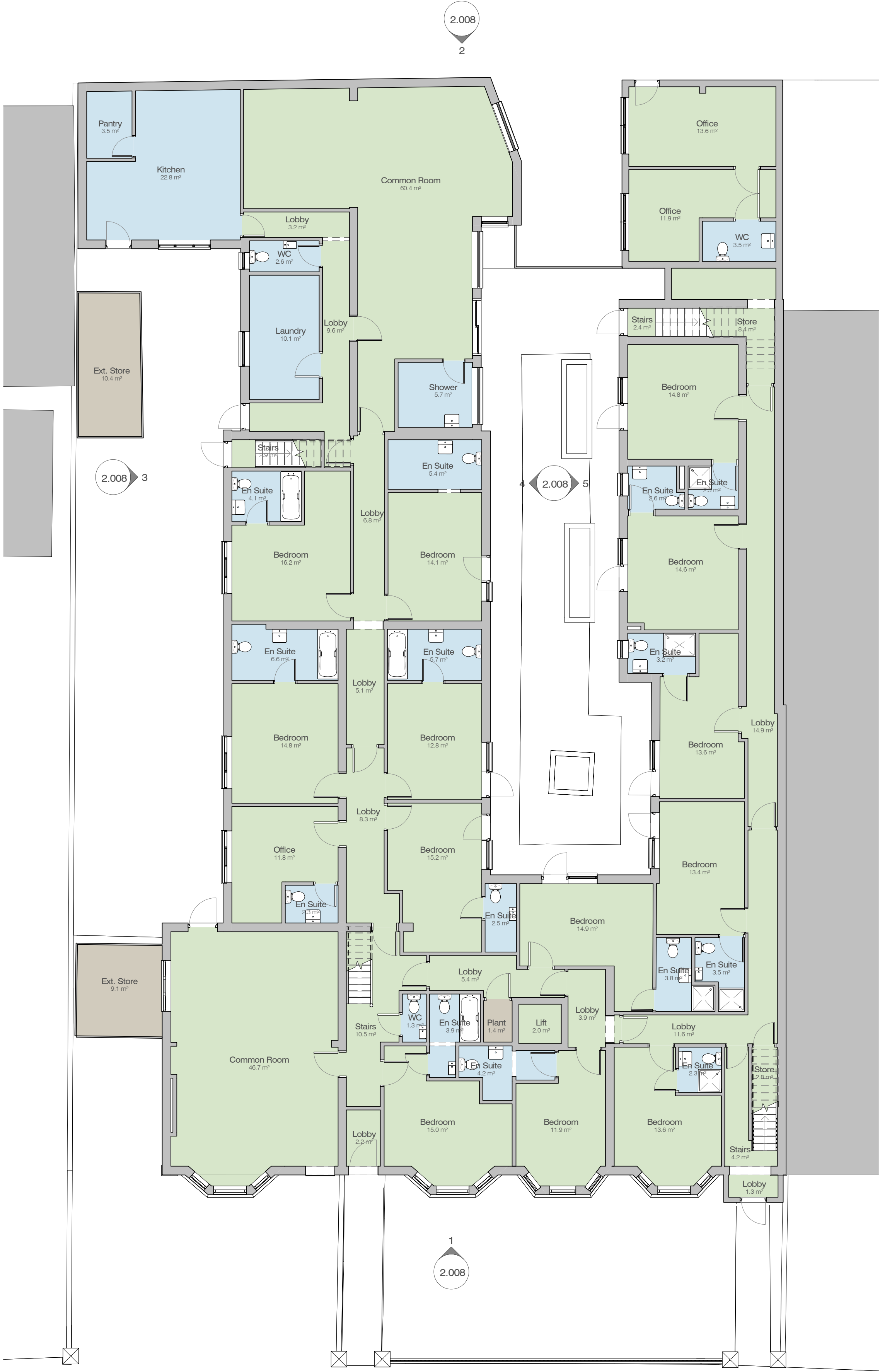
1. Level 00 - Existing scale 1 : 100