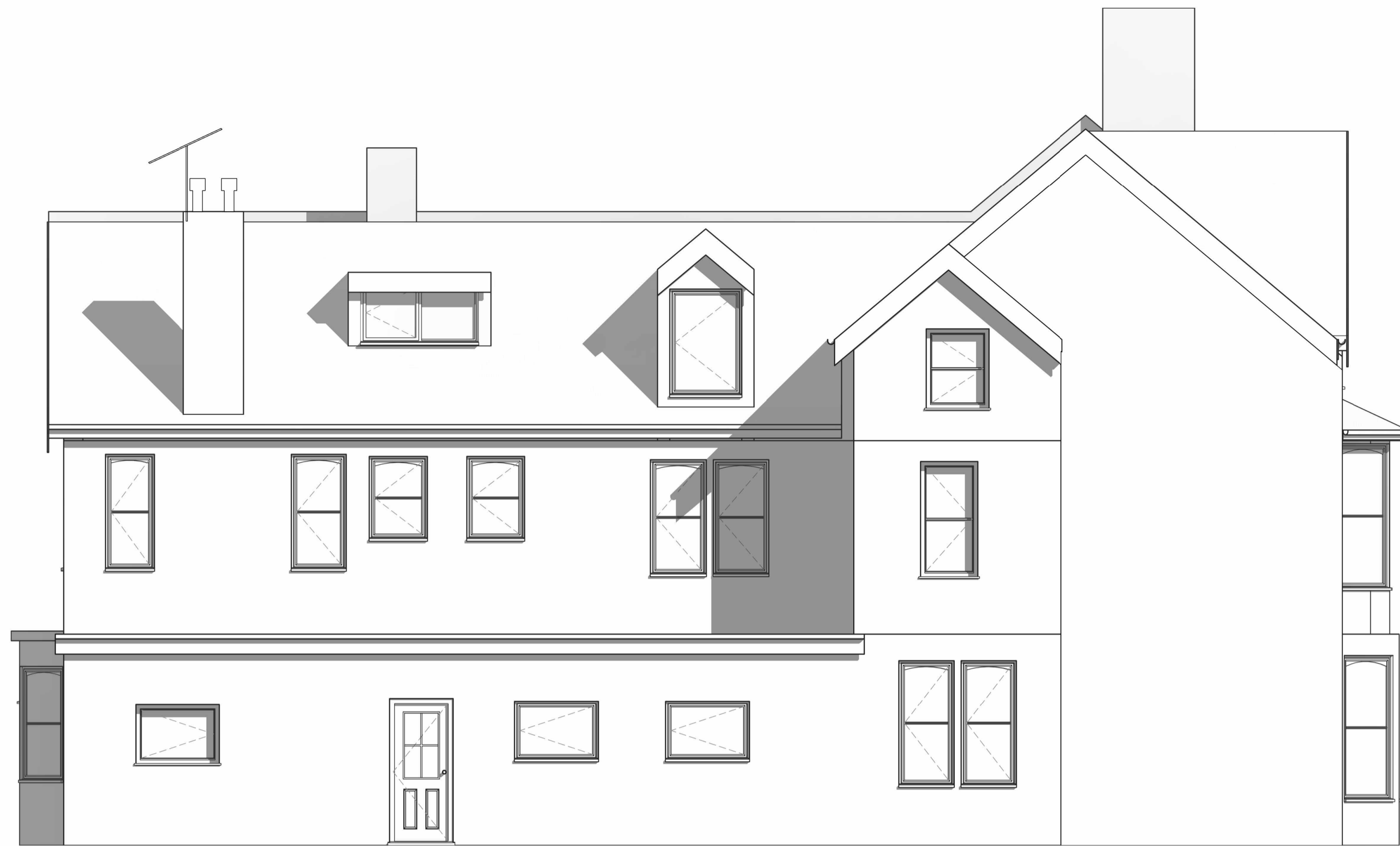
1 Existing Side 1 : 50