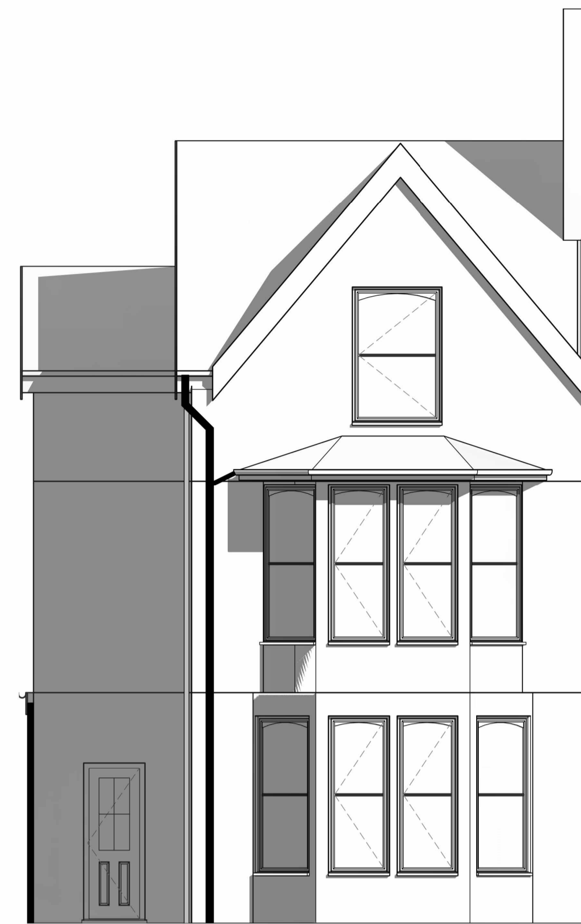
2 Existing Front 1 : 50