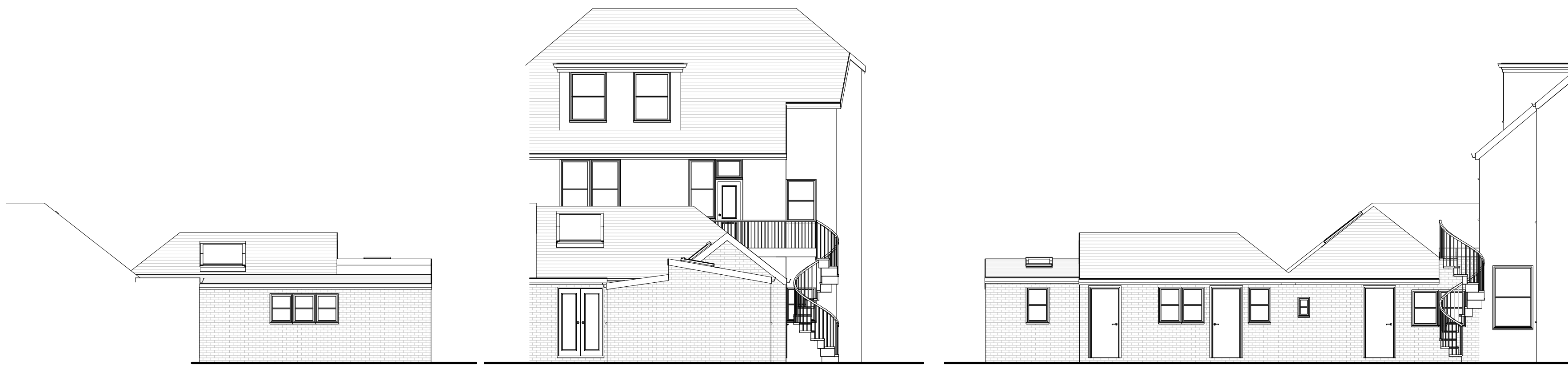
Side Elevation West Existing