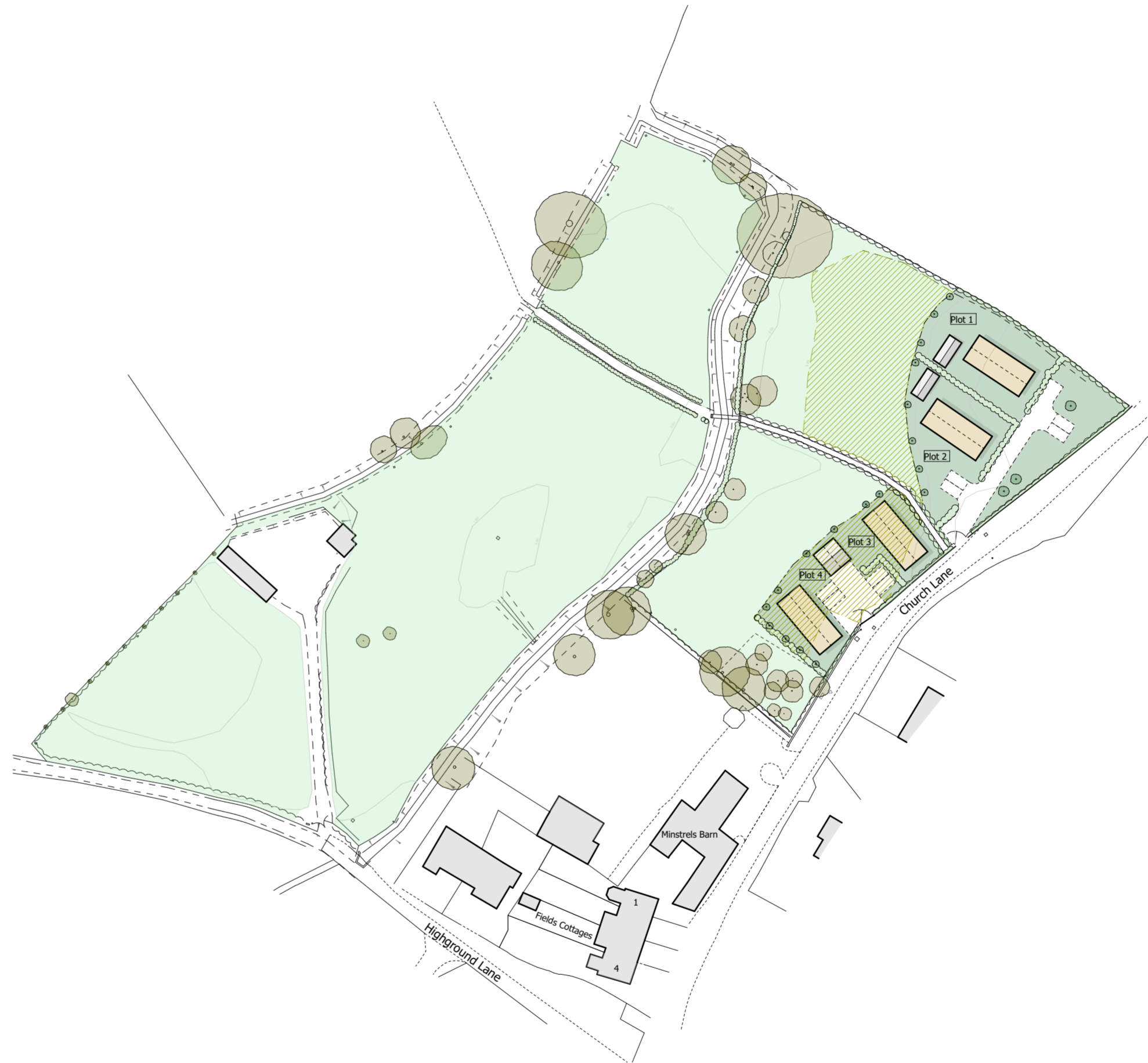
BLOCK PLAN 1:1000