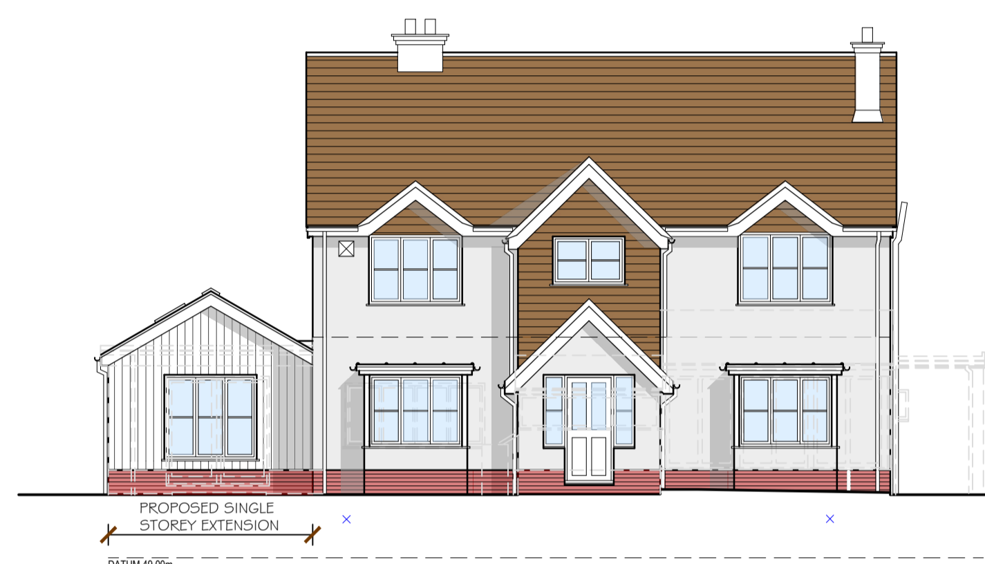
FRONT (WEST) ELEVATION