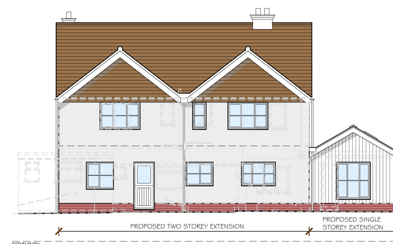
REAR (EAST) ELEVATION