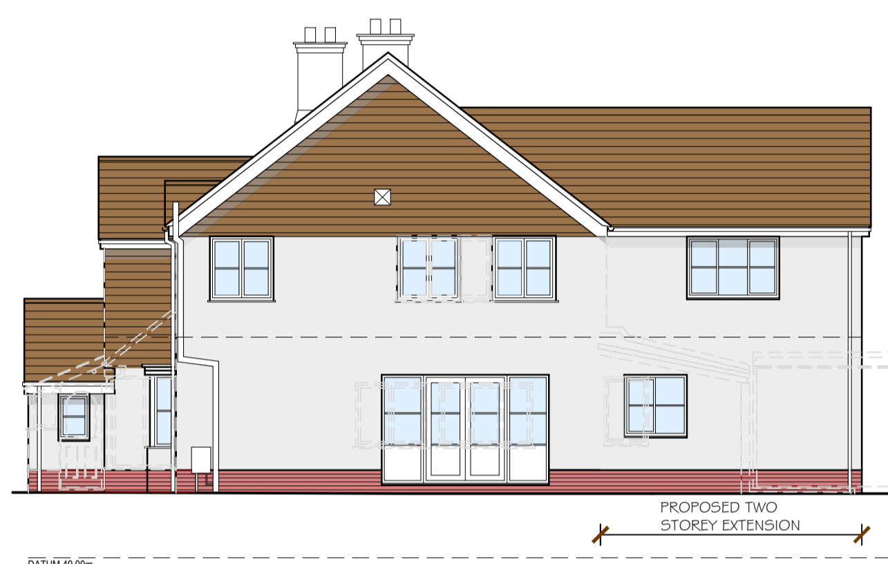
SIDE (SOUTH) ELEVATION