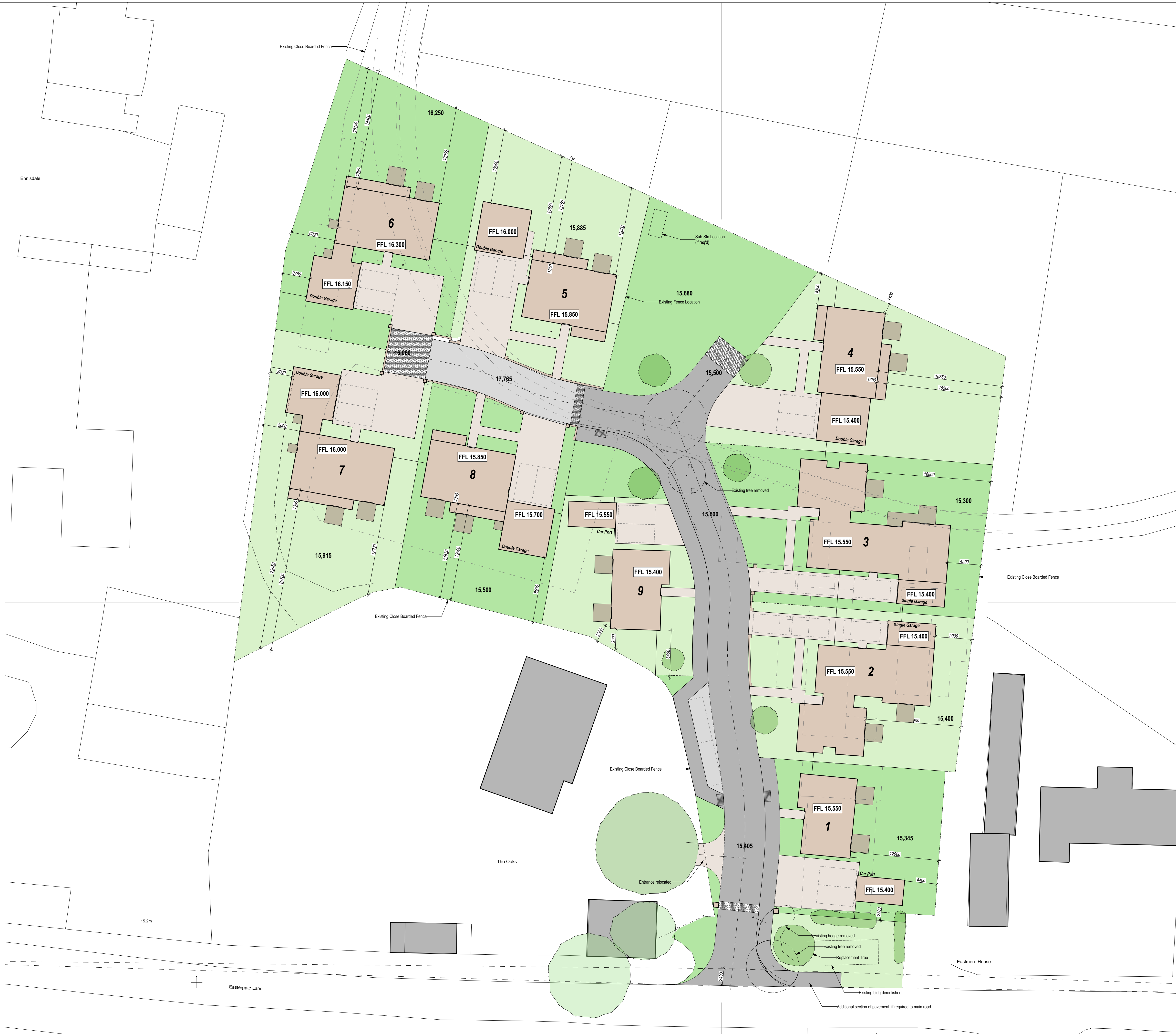
Proposed Site Plan 1:250

This drawing and its design content is copyright of Symmetry Architecture Ltd. It shall be read in conjunction with all other associated project information. Do not scale. All dimensions to be checked on site. If in doubt ASK. Date printed: 02/10/2024 Safety, Health & Environmental In addition to the hazards / risk normally associated with the type of works detailed on this drawing, please note the following information: