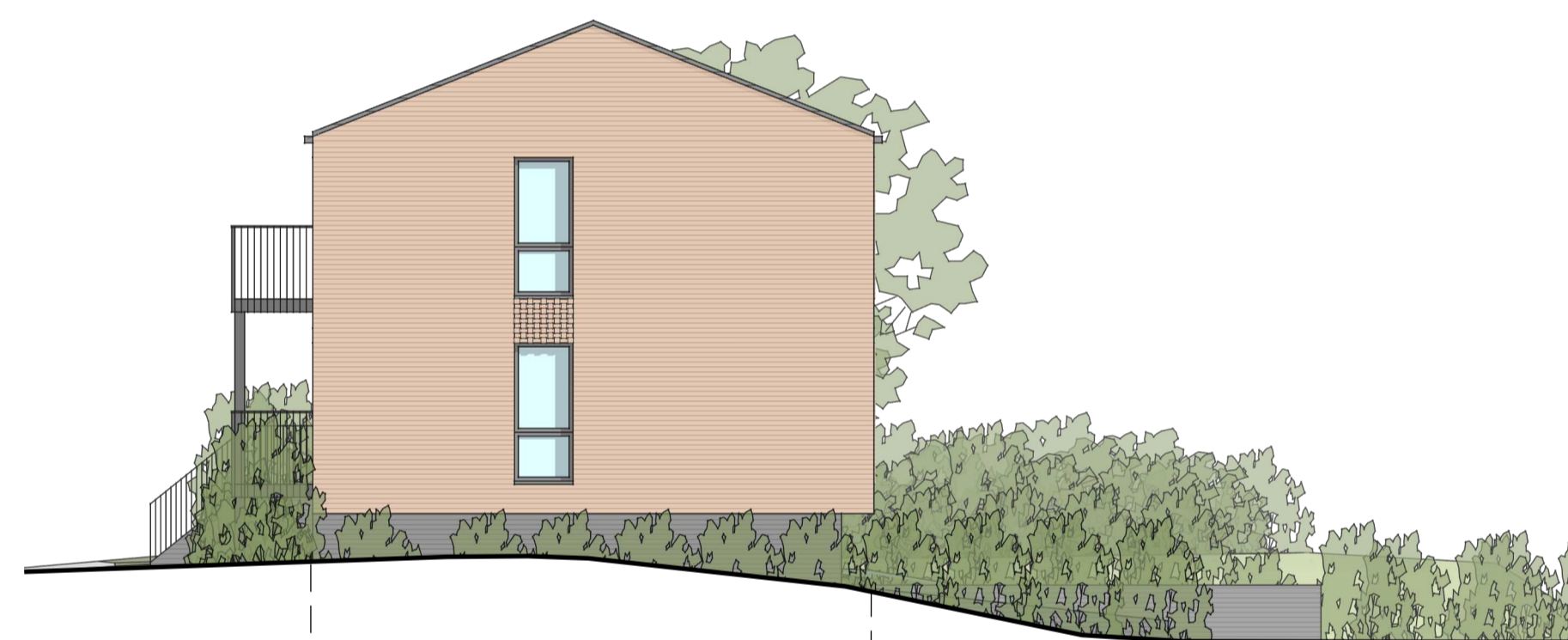
PROPOSED North East Elevation