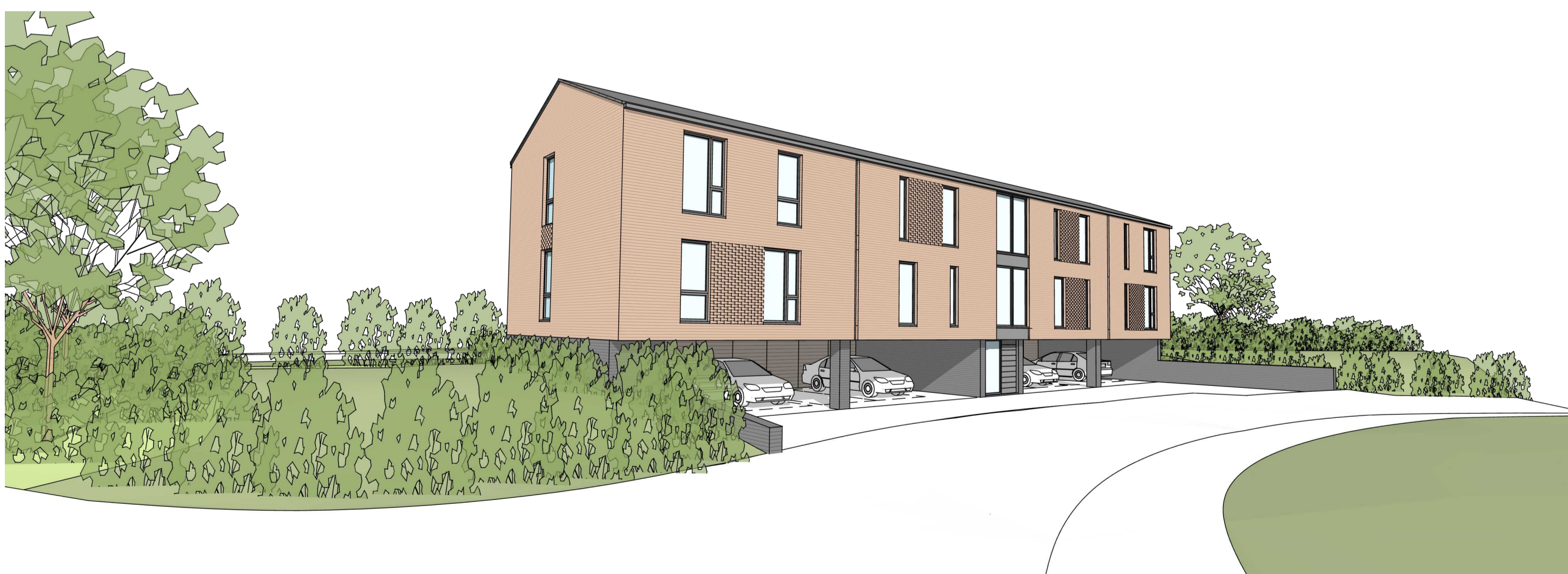
PROPOSED Street Scene from Ash Grove