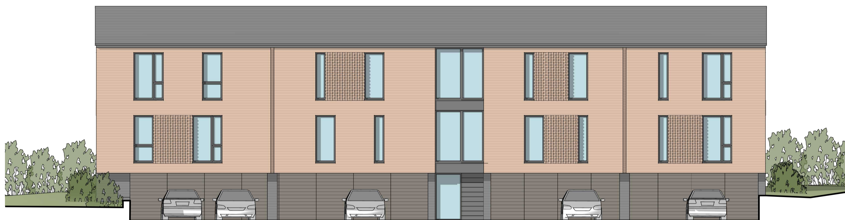
PROPOSED North West Elevation

THESE DRAWINGS ARE PRELIMINARY ONLY AND THE INTENDED DETAILS ARE NOT COMPLETE! THESE ARE NOT FOR CONSTRUCTION PURPOSES