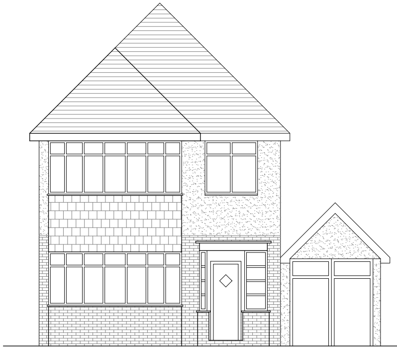
EXISTING FRONT ELEVATION 1:50