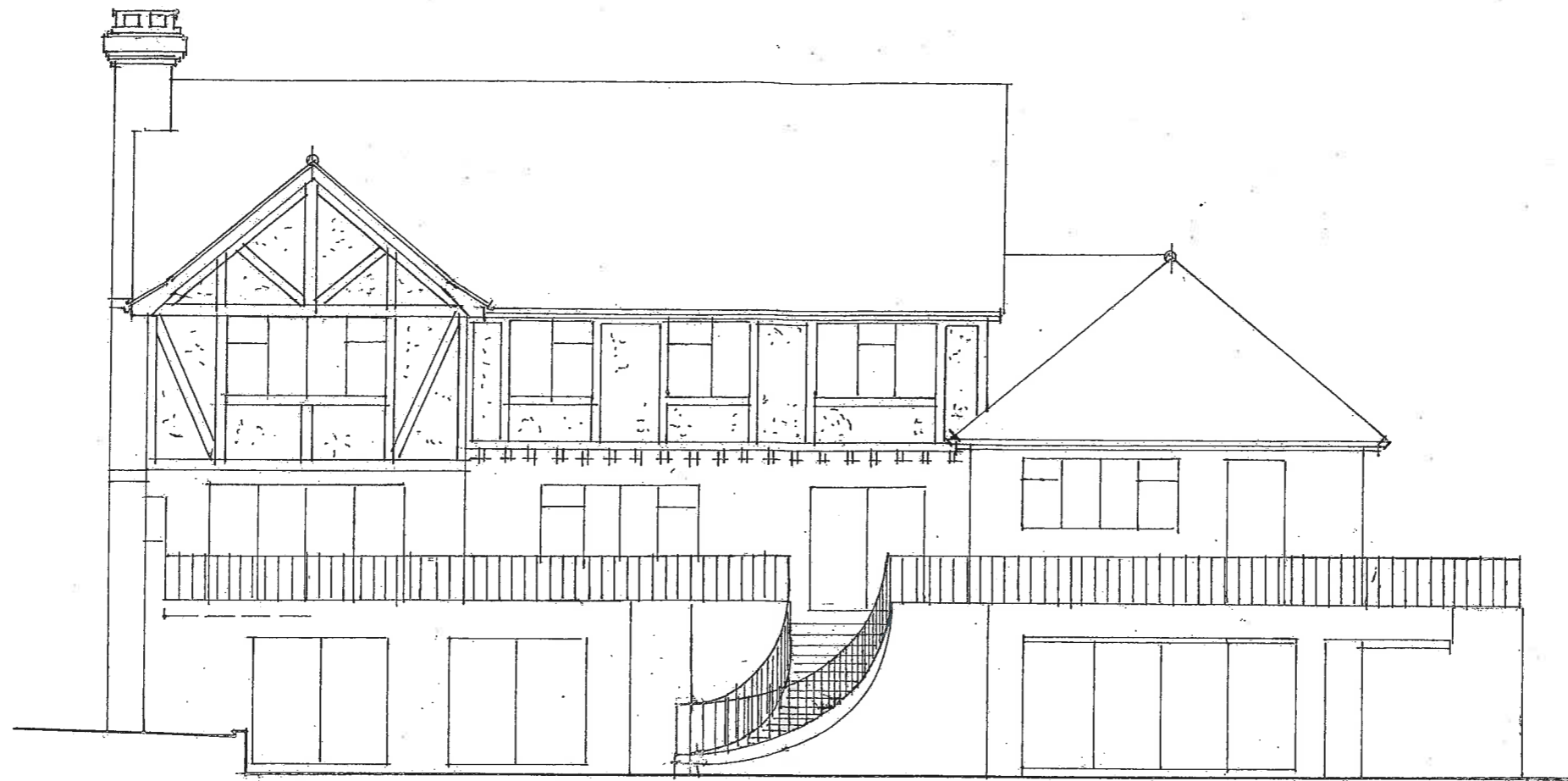
SOUTH [rear] 1/100