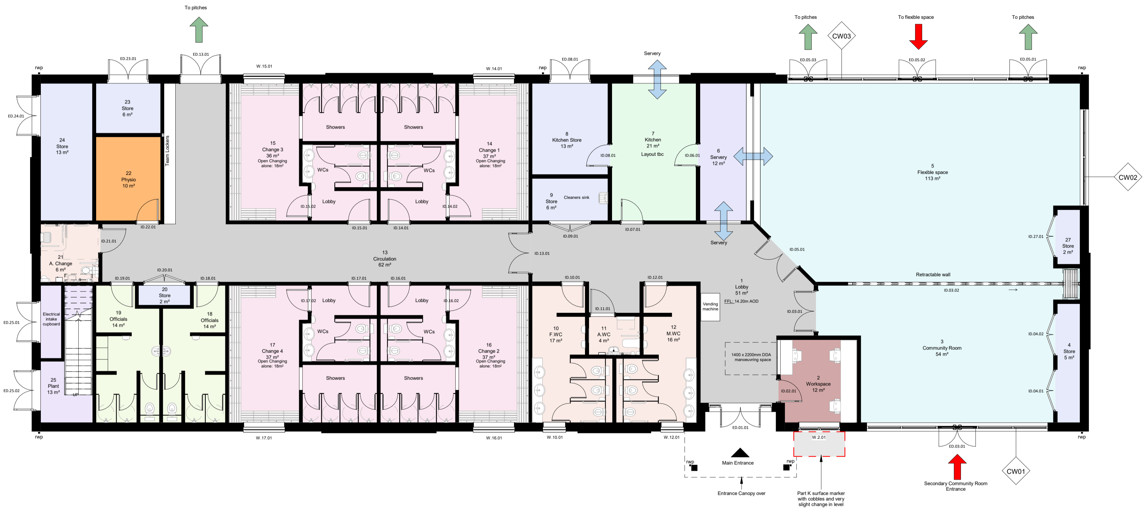
GA Ground Floor Plan 1 : 100