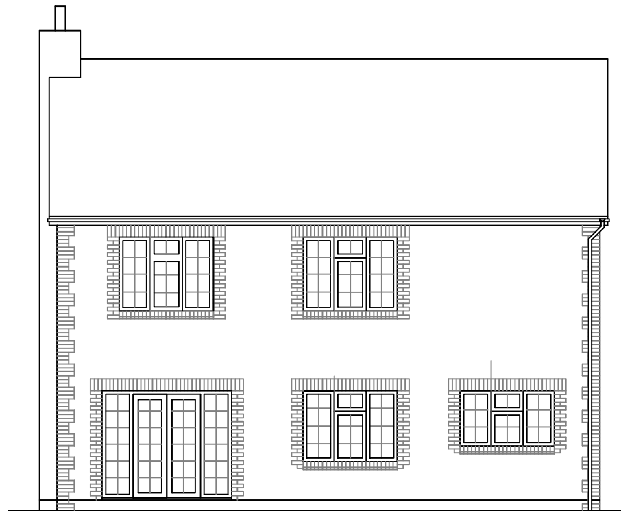
Existing Rear Elevation (South)