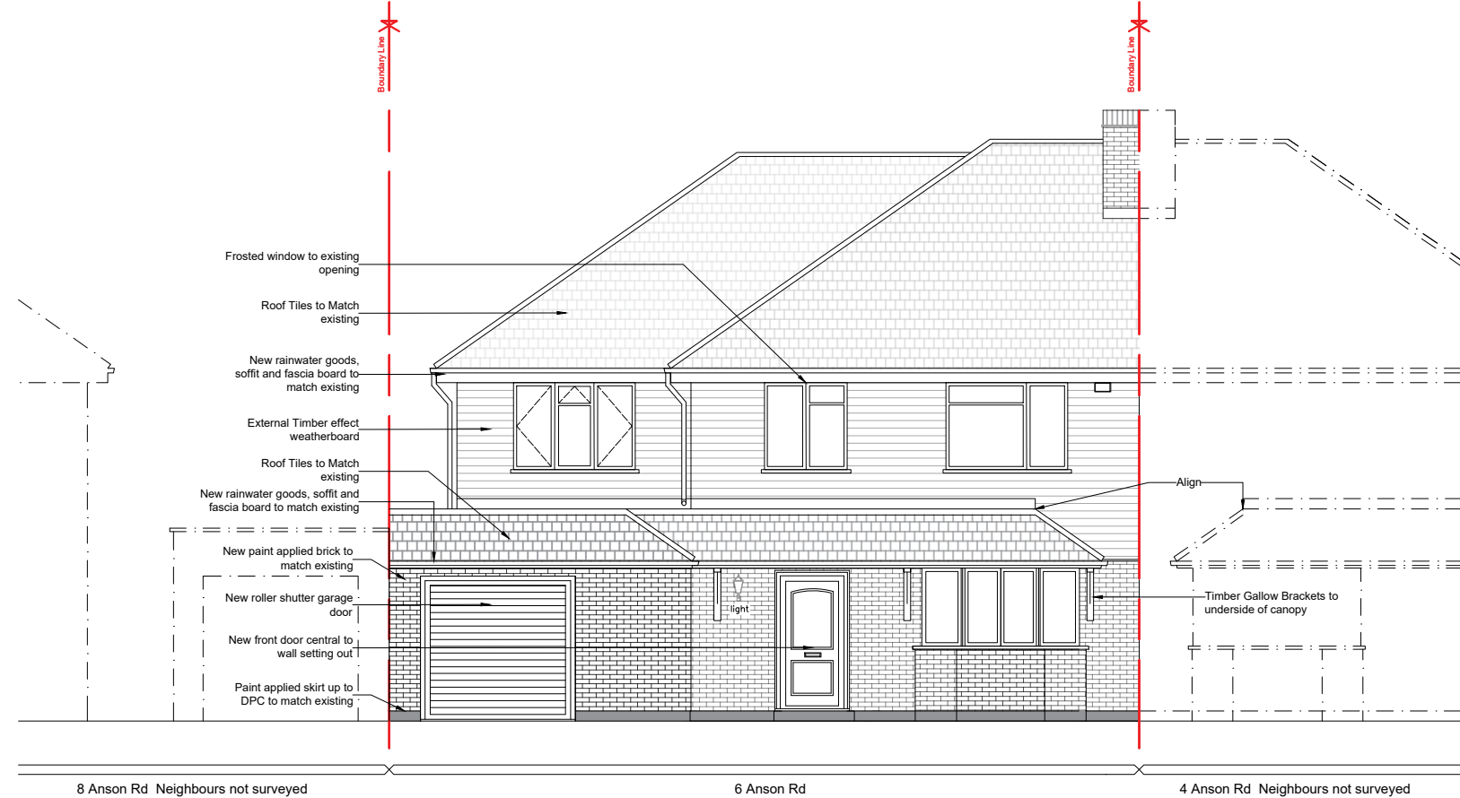
01 Proposed Front Elevation 101 1:100

Notes: All drawings are subject to Planning and Building Control consent. The details shown are for design intent purposes only and are subject to further design development with suppliers and sub-contractors Proposals subject to consultation and approval from Local Authority Building Control ARUN DISTRICT COUNCIL