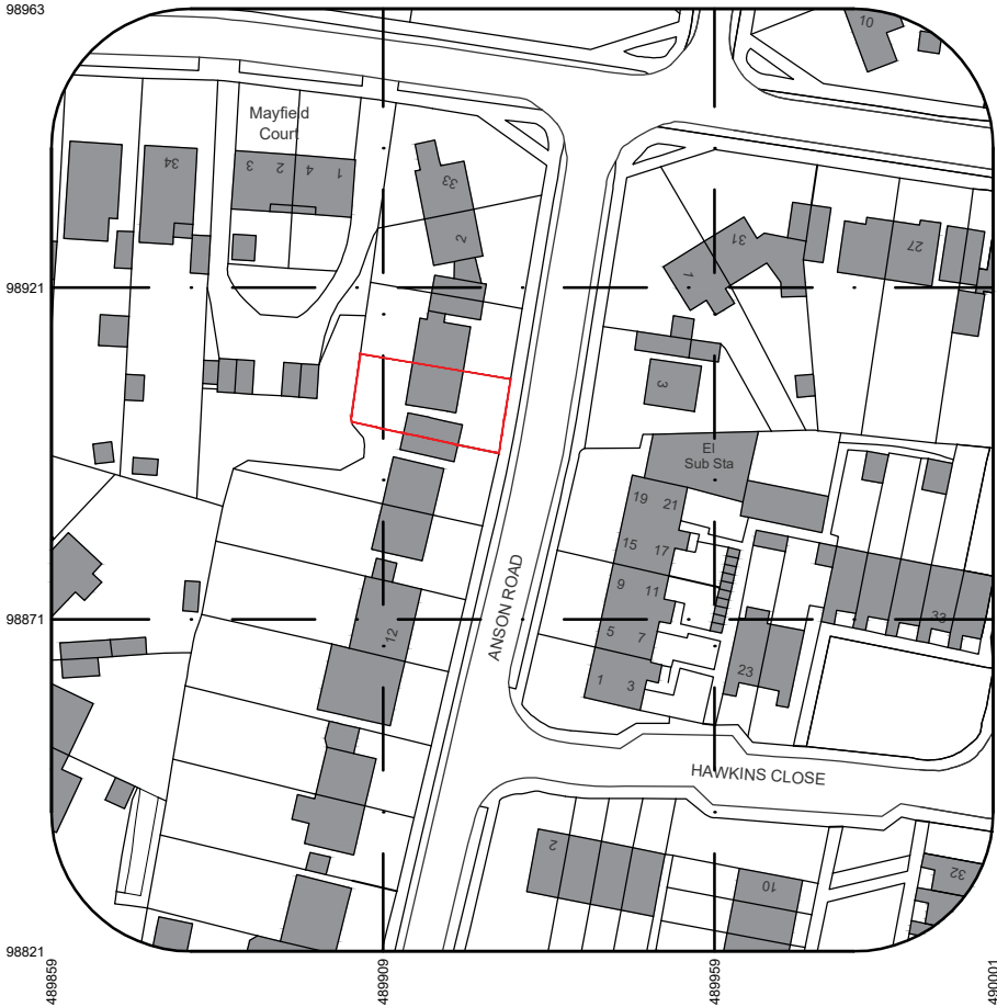
01 Existing Location Plan 000 1:1250

CDM REGULATIONS 2015 The client must abide by the Construction Design and Management Regulations 2015. The client must appoint a contractor, if more than one contractor is to be involved, the client will need to appoint (in writing) a principal designer (to plan, manage and coordinate the planning and design and a principal contractor (to plan, manage and coordinate the construction and ensure there are arrangements in place for managing and organising the project)