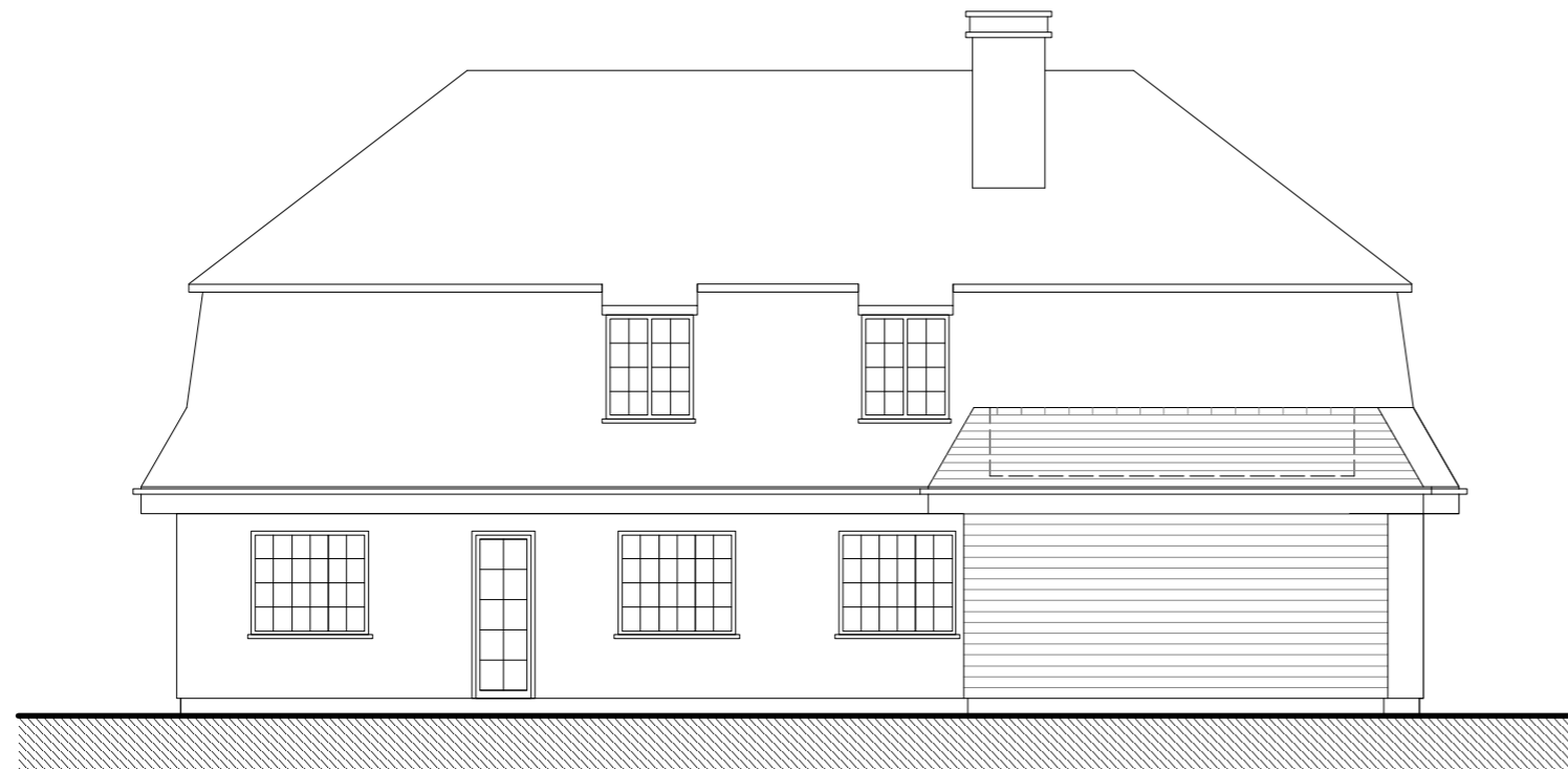
Proposed Side Elevation (East)