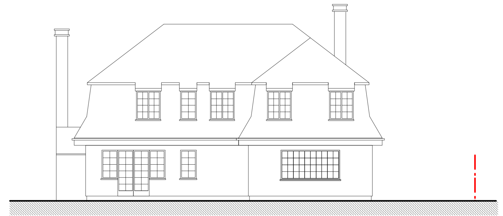
Existing Rear Elevation (North)