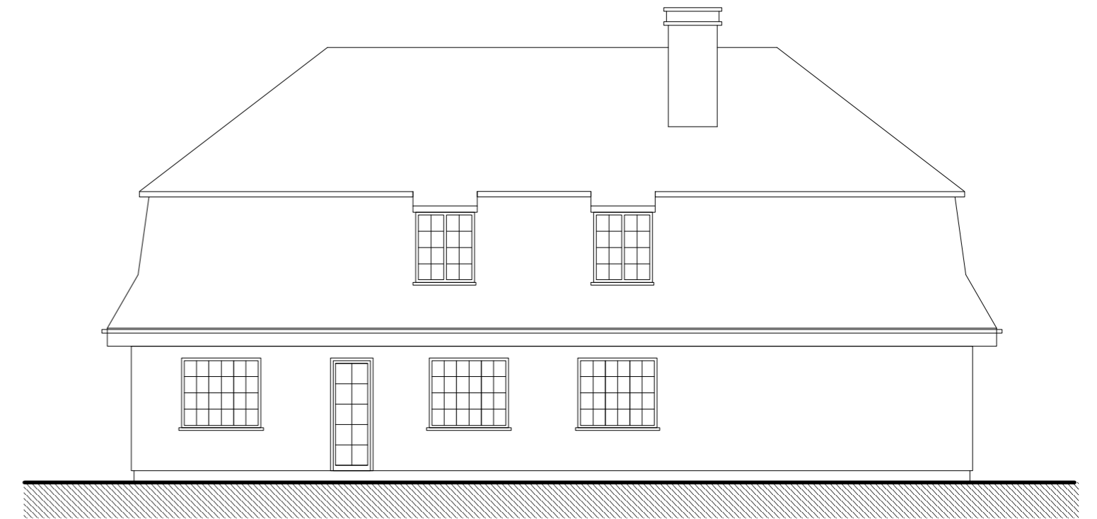
Existing Side Elevation (East)