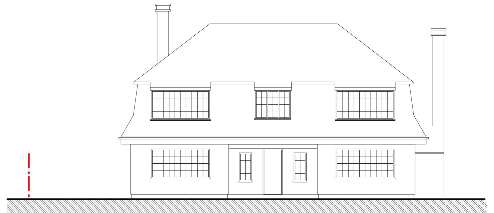
Existing Front Elevation (South)