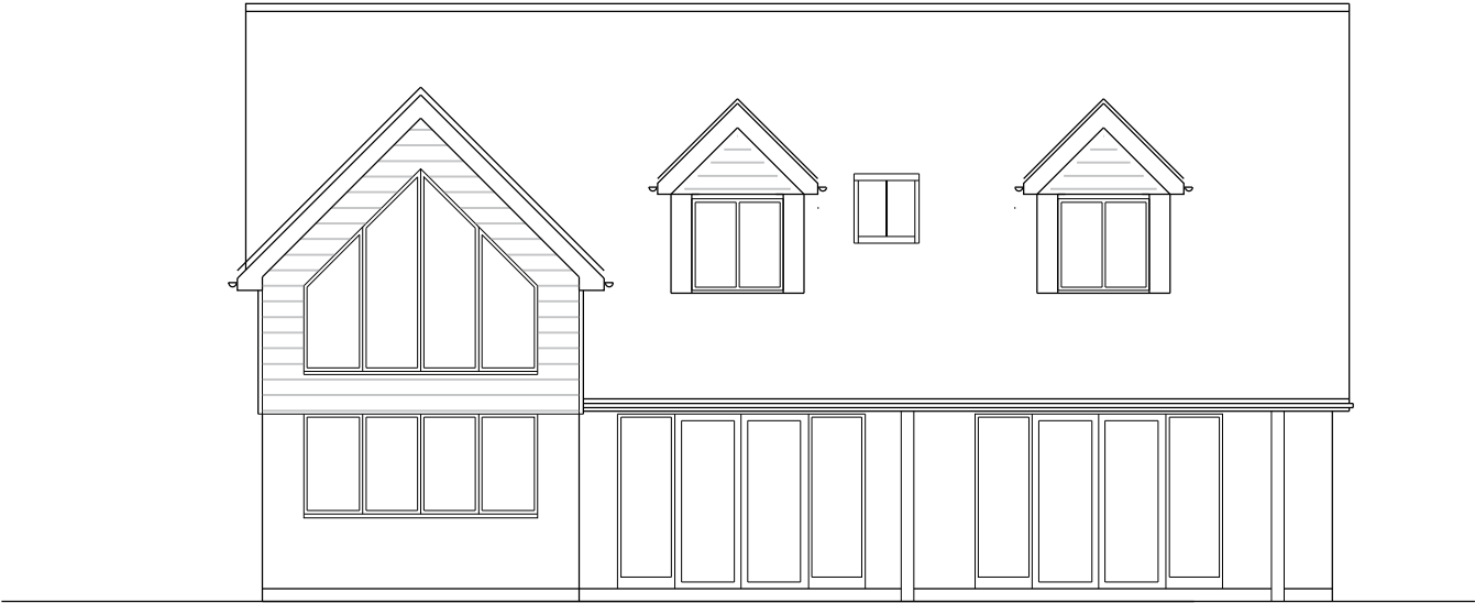
PROPOSED NORTH ELEVATION SCALE 1:100 @ a3