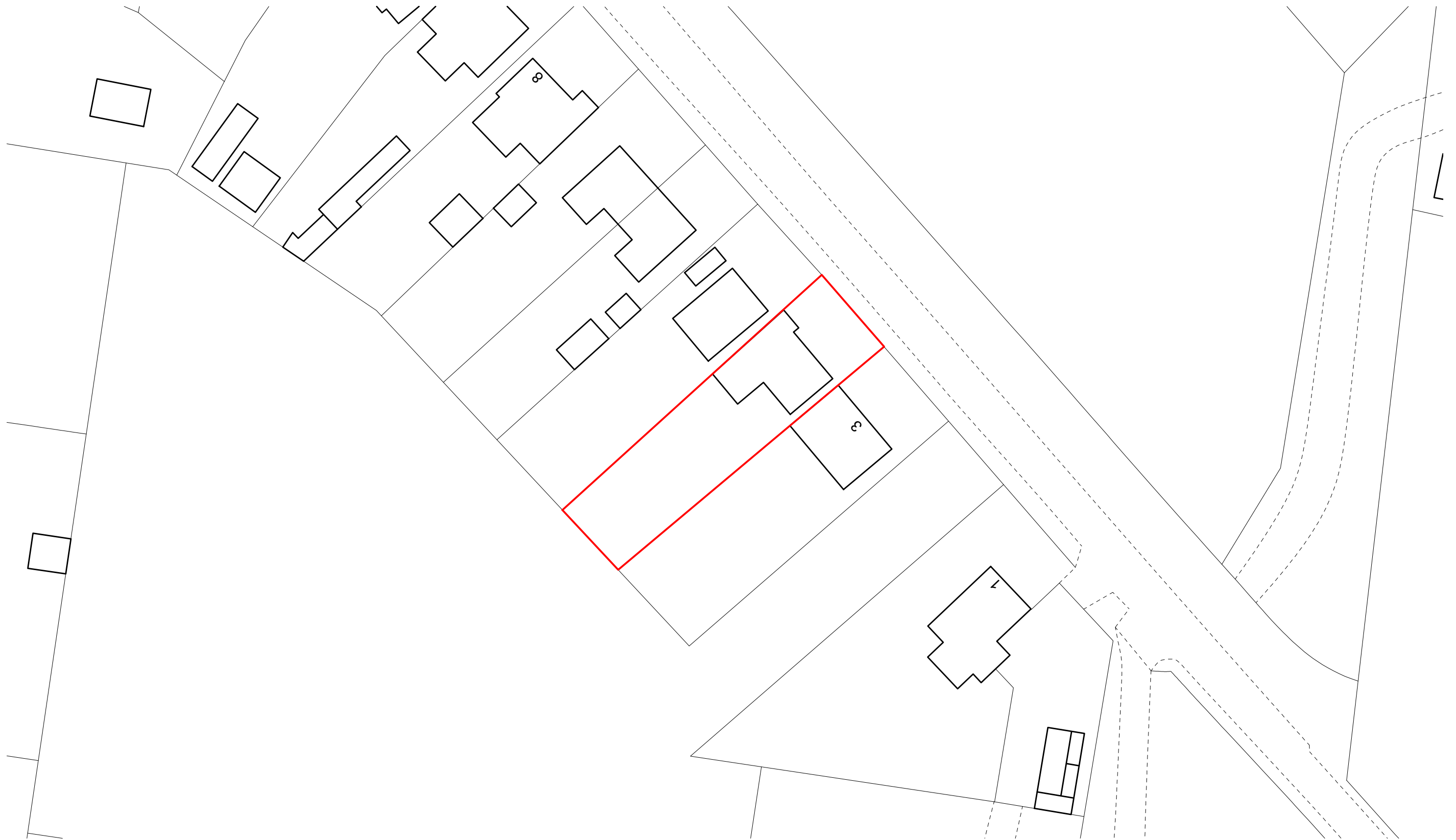
① BLOCK PLAN - AS PROPOSED Scale: 1:500