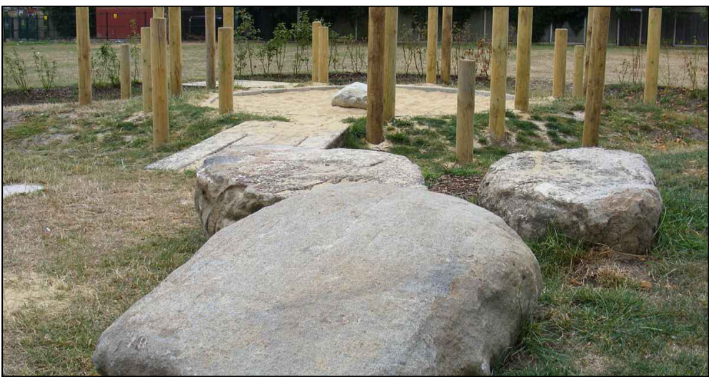
P1 Play Boulders Supplier: CED stone or similar approved Inclusive: No CFH: tbc Age: 2+ yrs