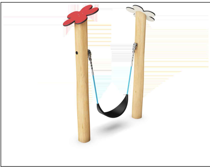
P4 Flower Swing (NRO916) Supplier: Kompan or similar approved Inclusive: Yes CFH: 80cm Age: 1+ yrs