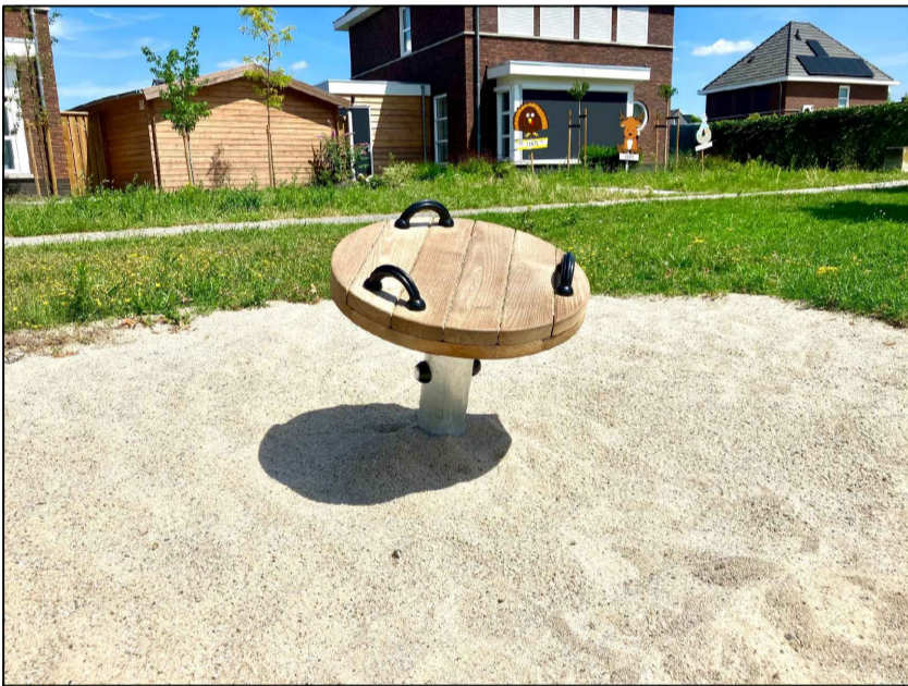
P3 Spinner Plate (NRO110) Supplier: Kompan or similar approved Inclusive: No CFH: 47cm Age: 4+ yrs