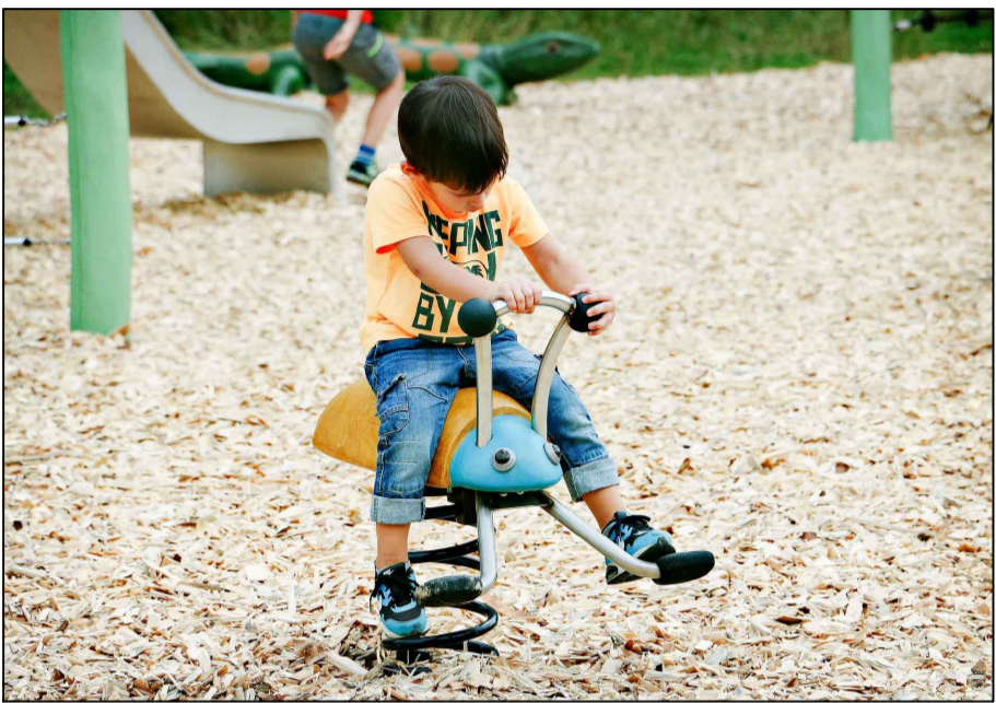
P2 Forest Bug Springer (NRO112)/Snail Springer (NRO115) Supplier: Kompan or similar approved Inclusive: Yes CFH: 60cm Age: 3+ yrs