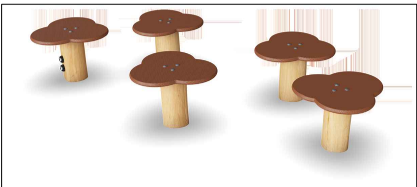
P5 Waterlilies Balance Post (NRO820) Supplier: Kompan or similar approved Inclusive: Yes CFH: 32cm Age: 2+ yrs