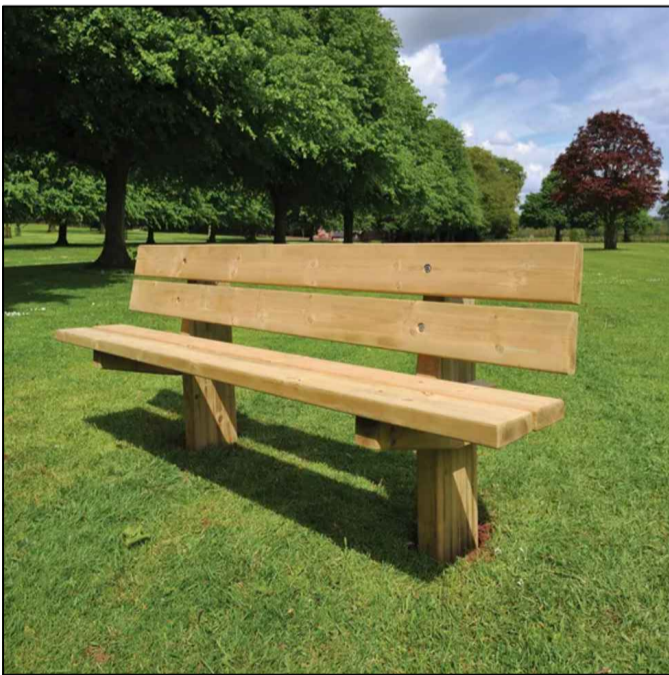
FI Bench and Bin Hatton Rustic 4 Slat Seat Supplier: Broxap or similar approved Derby Standard Litter Bin Supplier: Broxap or similar approved