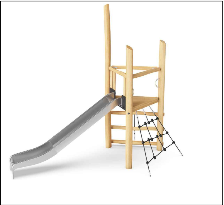
P3 Tower with Slide Supplier: CED stone or similar approved