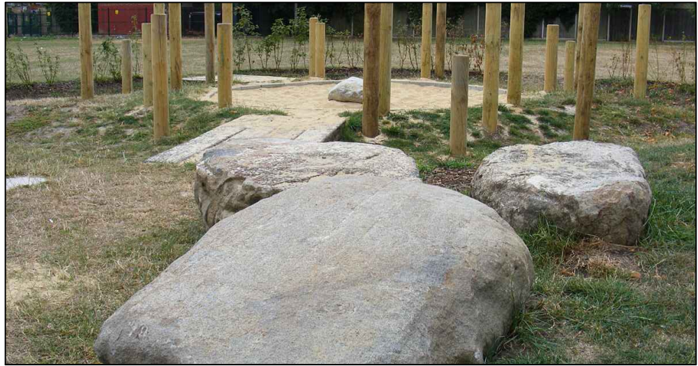
P1 Play Boulders Supplier: CED stone or similar approved