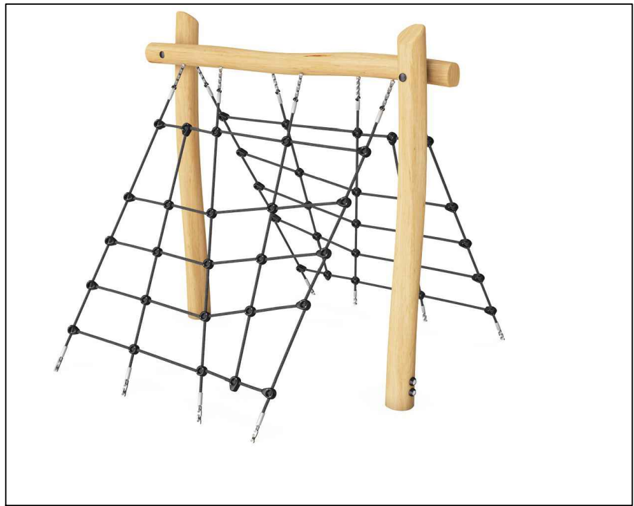
P2 Double Web Climber Supplier: CED stone or similar approved