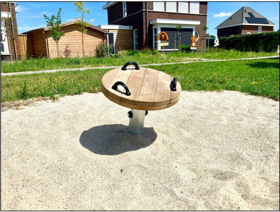
P4 Spinner Plate Supplier: CED stone or similar approved