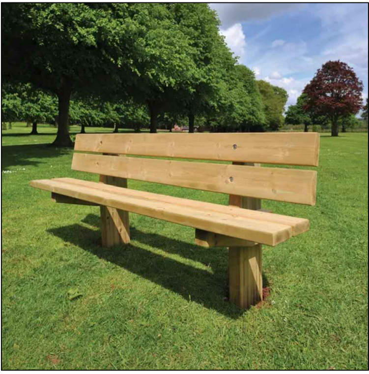
FI Hatton Rustic 4 Slat Seat Supplier: Broxap or similar approved