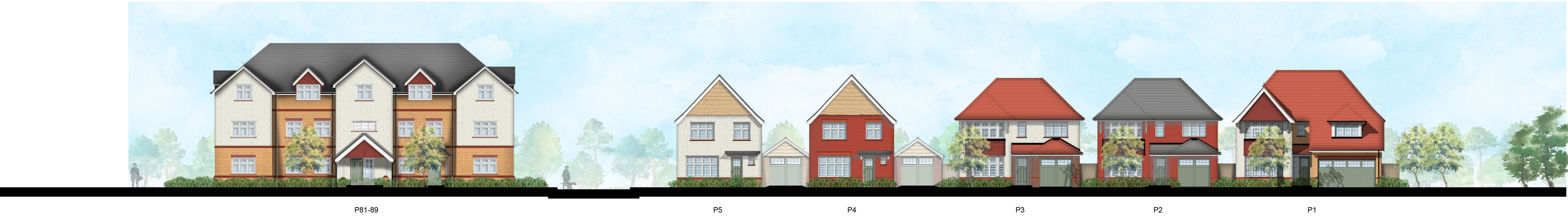
STREET SCENE B-B