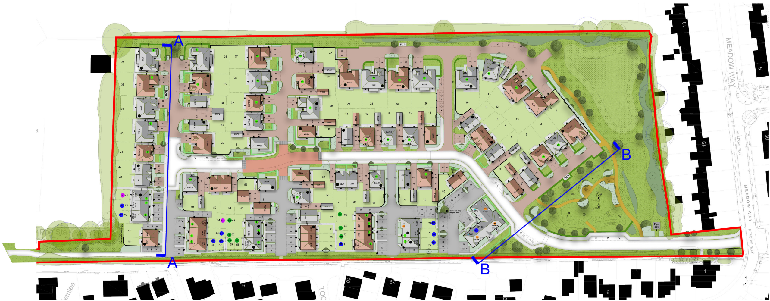
SITE LAYOUT 1:1250