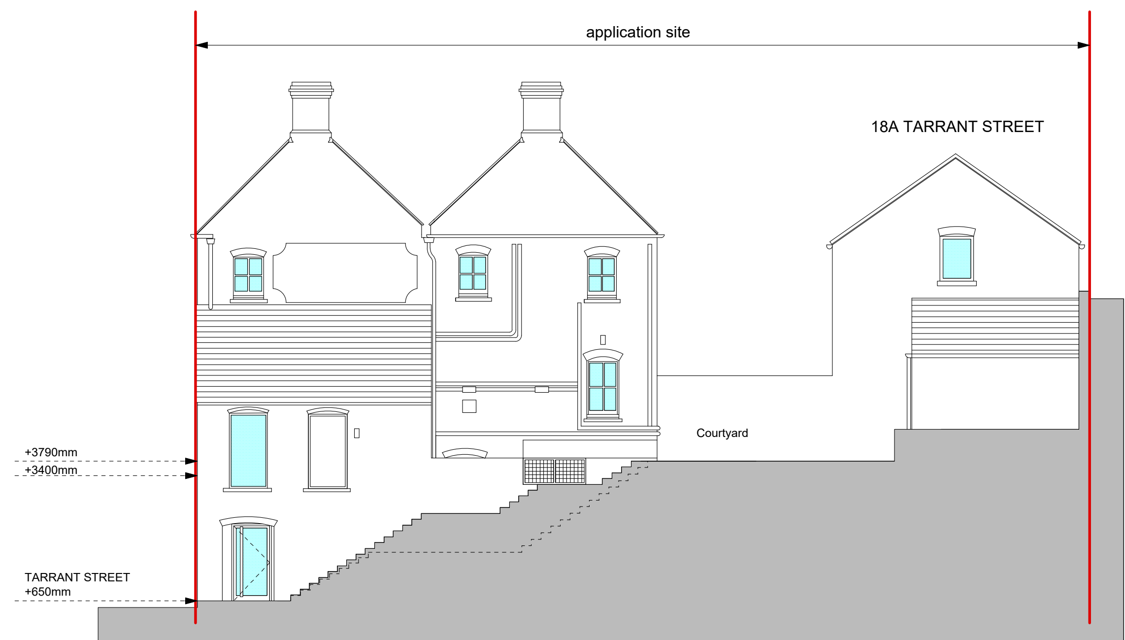
PARTLY IMPLEMENTED EAST ELEVATION (1:100)