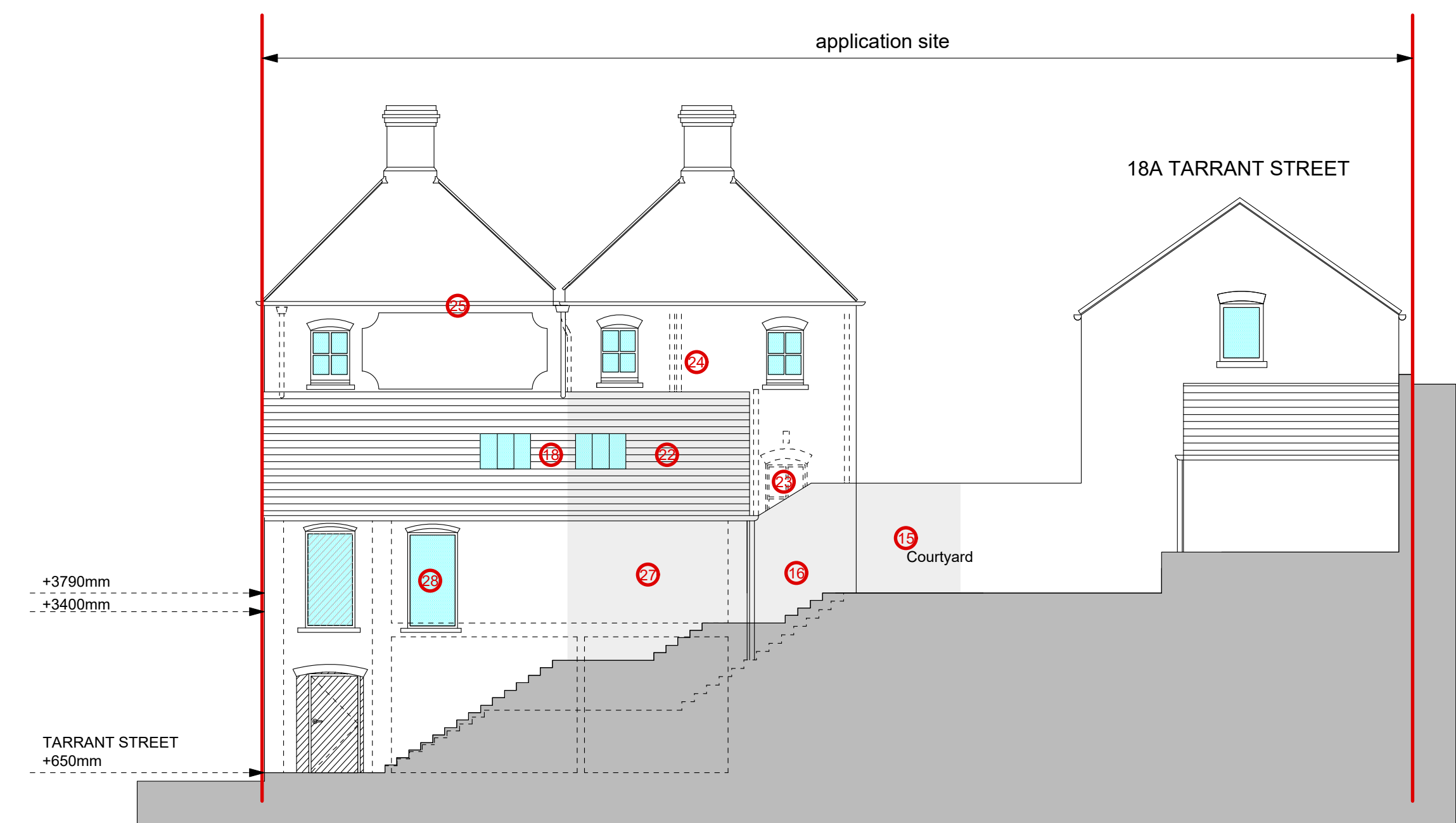
PROPOSED EAST ELEVATION (1:100)