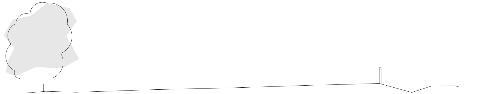
Existing Site Section Scale 1:250@A3