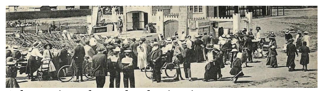
A fantastic and popular destination; Something exciting, something different