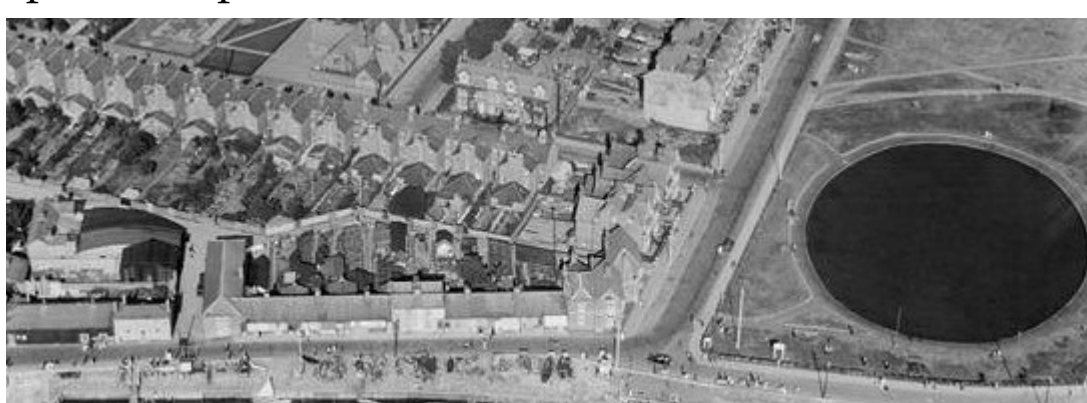
Oyster pond seamlessly connected with The Greens