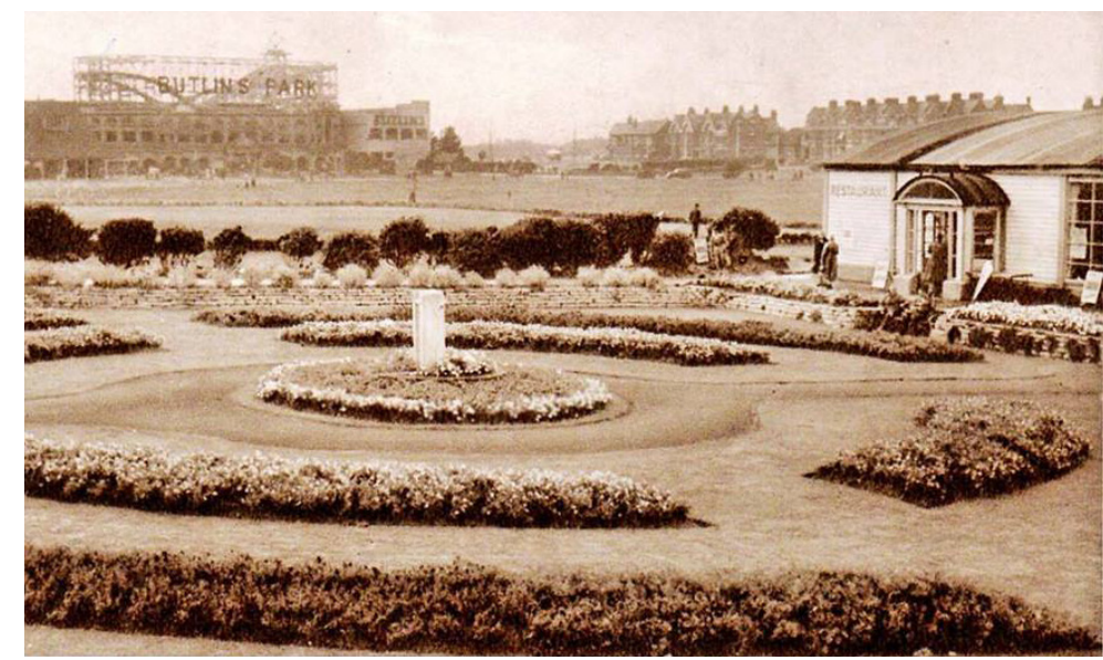
Restaurant/Café and beautiful gardens in the centre of The Greens