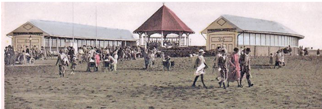
Focussed places for performance, ample spectator space