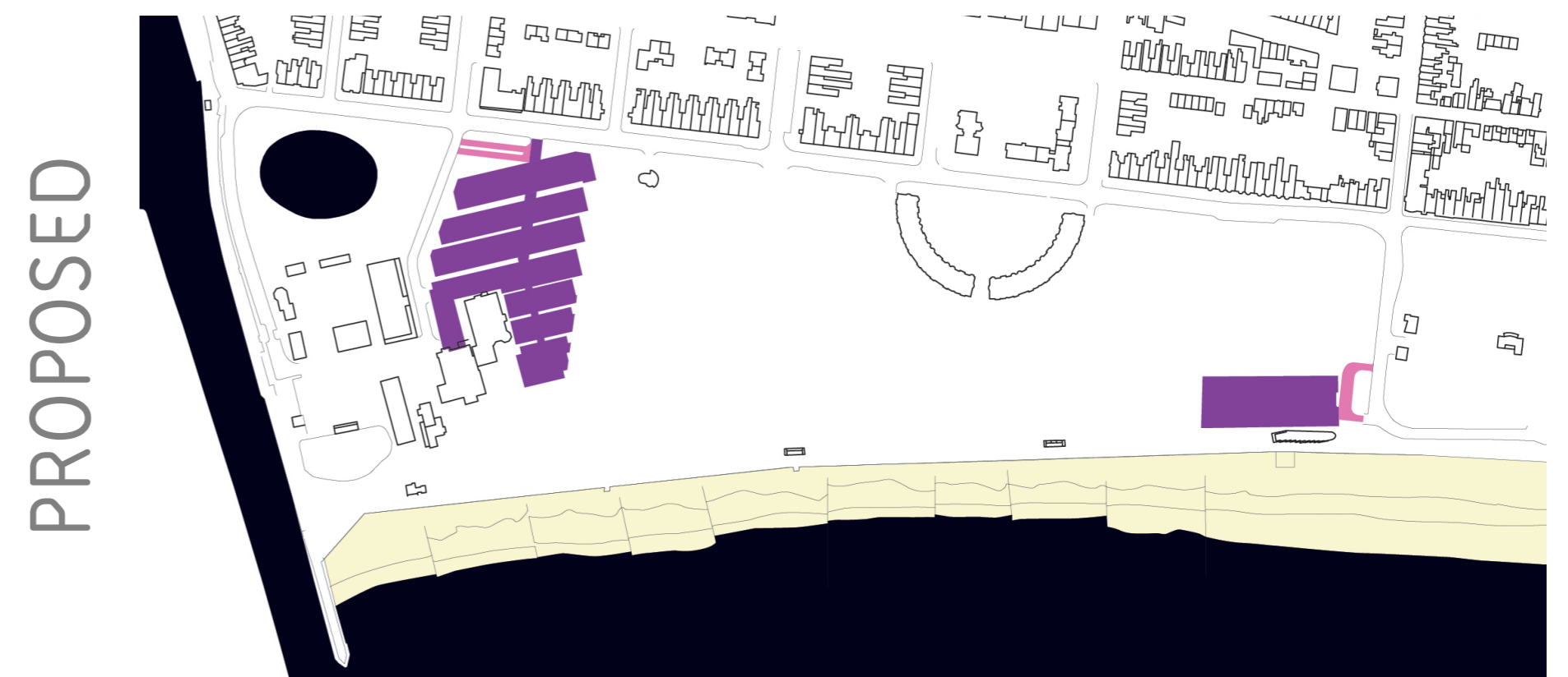
Formal surface car park