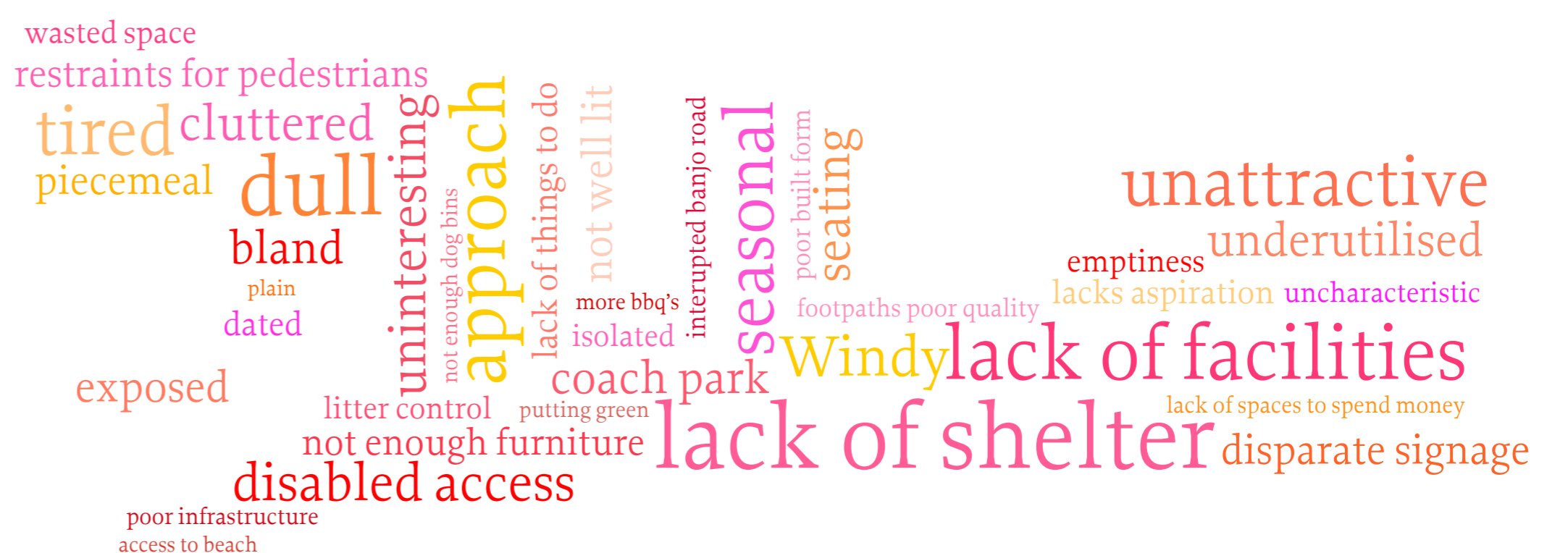
STAKEHOLDER WORKSHOP FEEDBACK