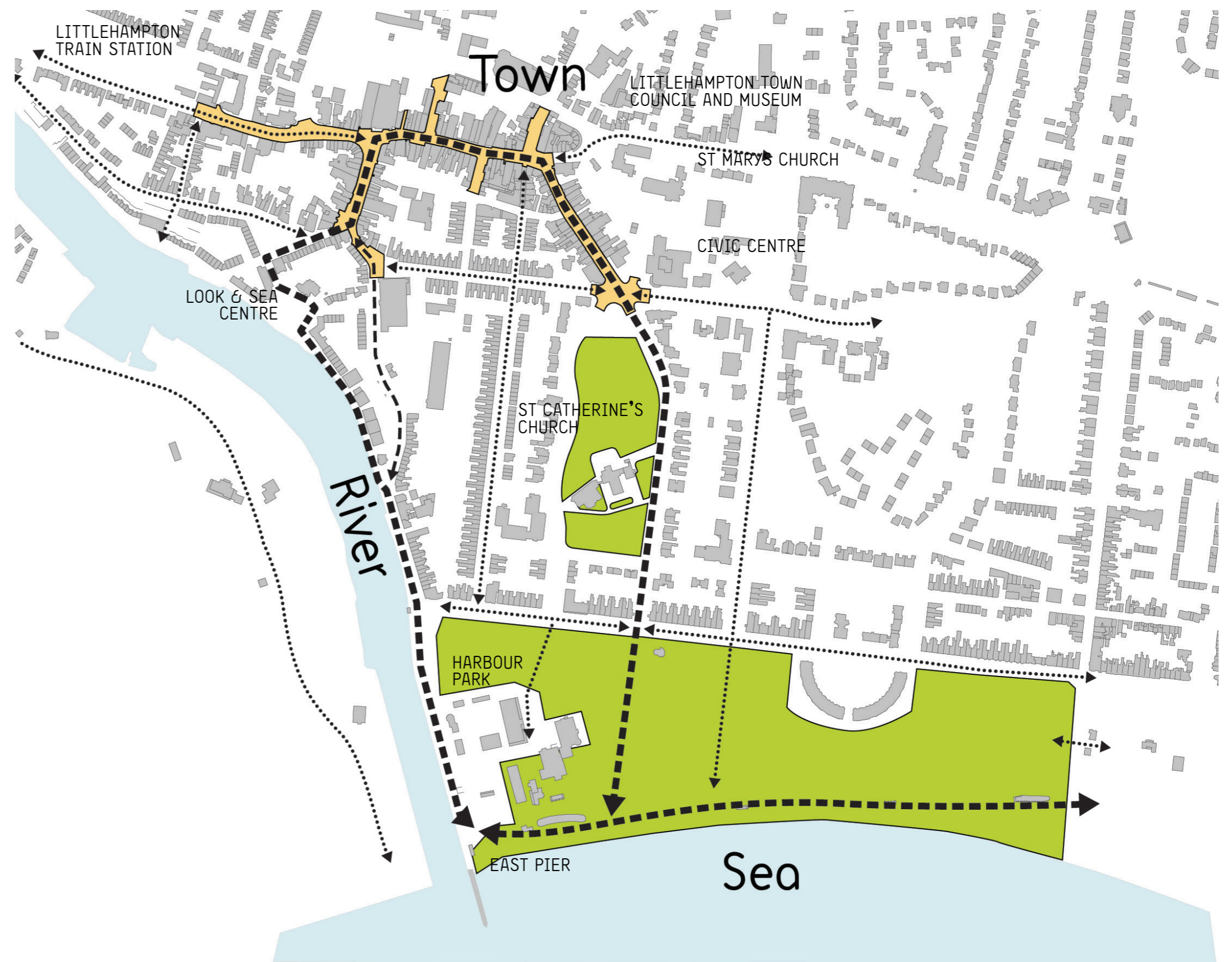
WIDER CONNECTION DIAGRAM

LDA Design, consultants appointed by Arun District Council, are familiar with Littlehampton through their long running involvement in the town's various strategies and public realm improvements such as the successful and popular East Bank Riverside Walkway and recent proposals for the Town Centre.