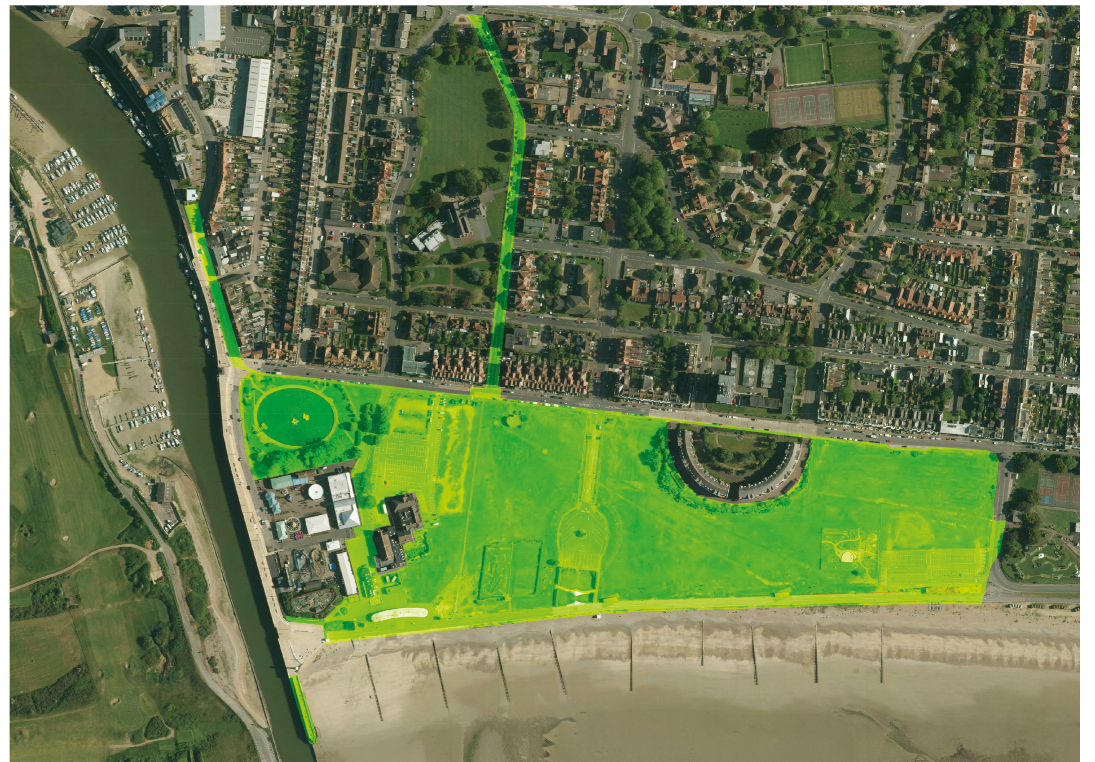
PROJECT STUDY AREA

Following these initial workshops LDA Design developed concept proposals on behalf of Arun District Council which can be viewed on the following boards.